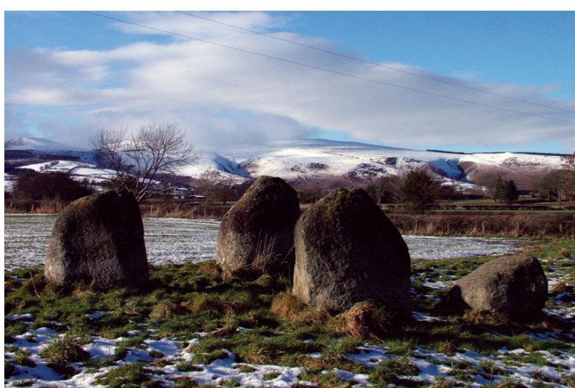
Little is now visible of the remarkable complex of Neolithic enclosures in the Walton basin. The Four Stones stone circle shown here may be later in date, and possibly belongs to the early Bronze Age.