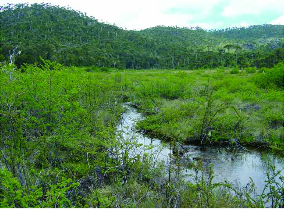
Figure 1: Pinguicula chilensis habitat at Las Turberas.