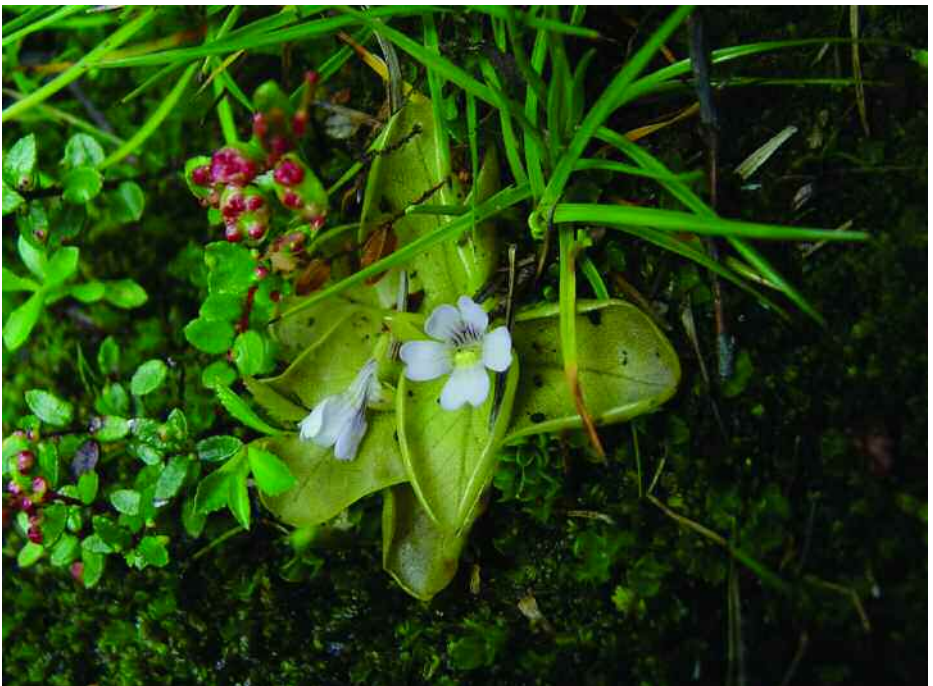
Figure 2: Front and side view of flower at Las Turberas.