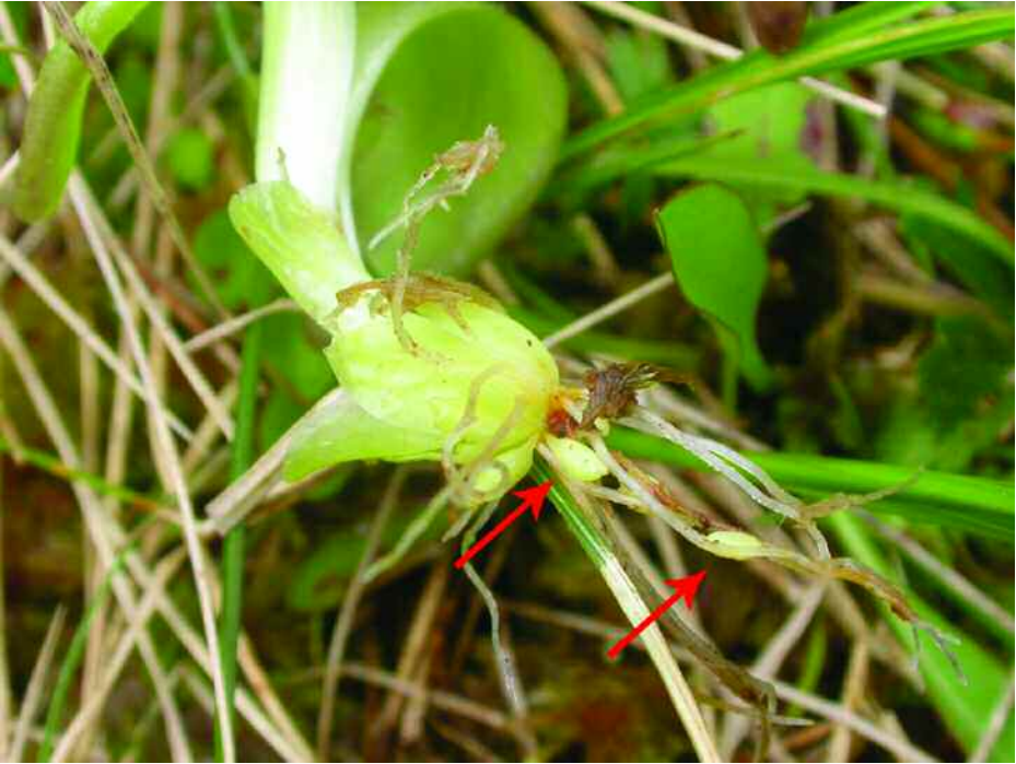
Figure 3: Basal rosette of P. balcanica , showing roots and several gemmae-like structures (arrows) in Bulgaria, Vitosha Mountain.