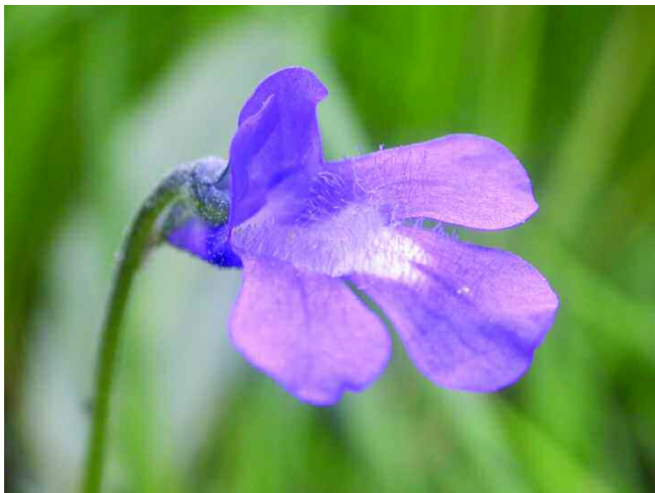
Figure 2: Pinguicula balcanica (Bulgaria, Vitosha Mountain), close-up of a flower.