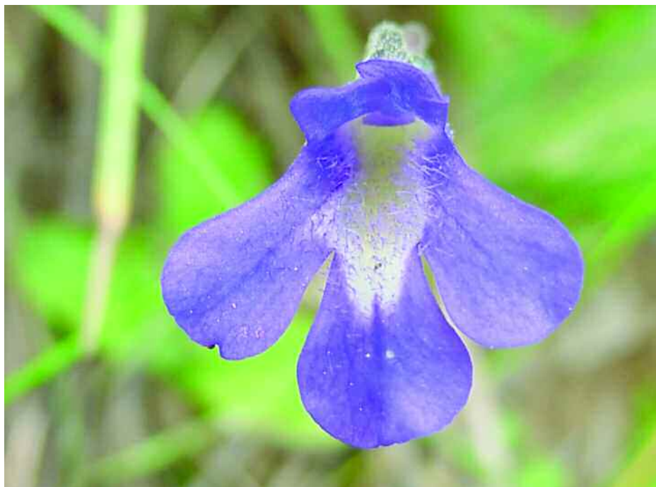
Figure 1: Pinguicula balcanica (Bulgaria, Vitosha Mountain), close-up of a flower.