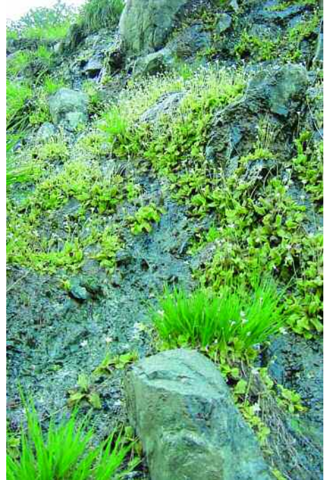
Figure 5: Hundreds of P. hirtiflora rosettes (Greece, N Pindhos) in flower.