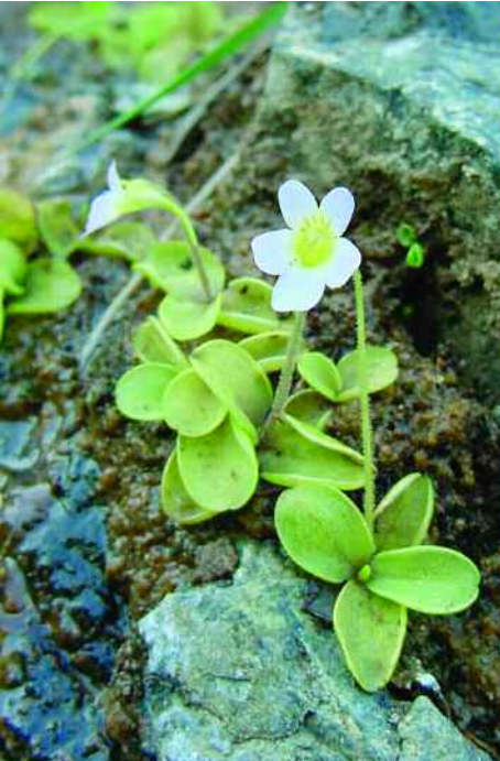
Figure 4: Pinguicula hirtiflora (Greece, N Pindhos) in flower.