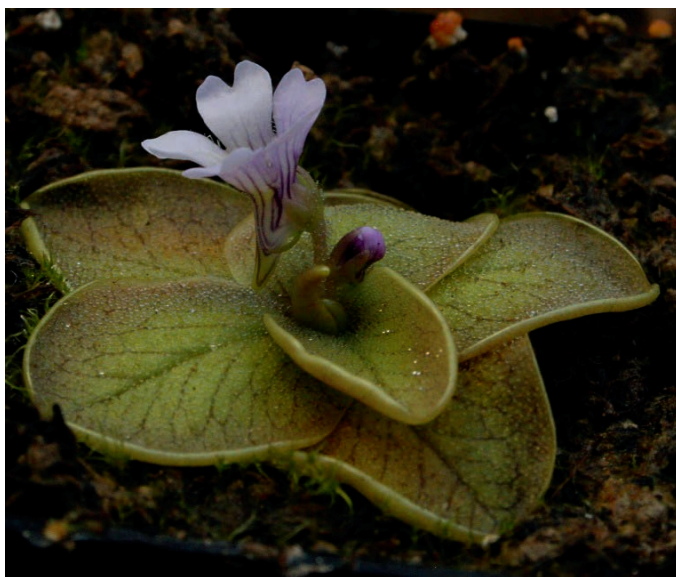
Figure 5: Pinguicula nahuelbutensis . Plant with pale violet flower and flower bud (in cultivation). The flower shows a dark violet venation on the outside of the corolla, tube and spur.