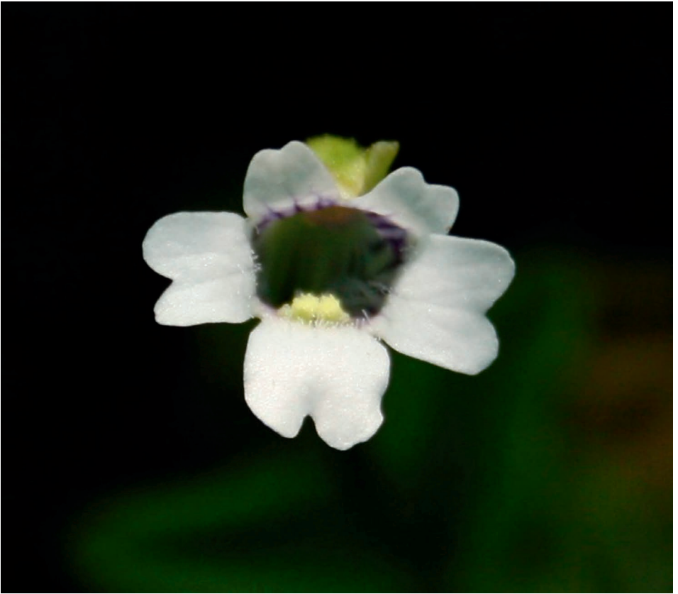
Figure 2: Pinguicula antarctica . Front view of a flower. The yellow 2-parted palate is located at the base of the middle lobe of the lower lip and the corolla is bilabiate with white colored petals (photo from a cultivated specimen originating from Isla Grande de Chiloé, Chile).

Curacautín, Sierra Nevada, ca. 1670 m (personal observations); región de los Ríos, Osorno, paso Puyehue; Argentina: provincia de Río Negro, Parque Nacional Nahuel Huapi, Cerro Nireco; provincia de Río Negro, Parque Nacional Nahuel Huapi, Cerro de la Nubes; provincia de Neuquén, paso de Pino Hachado; provincia de Neuquén, Cerro Campana; provincia de Neuquén, Arroyo los Guemados; provincia de Neuquén, Copahué (see Fig. 3).