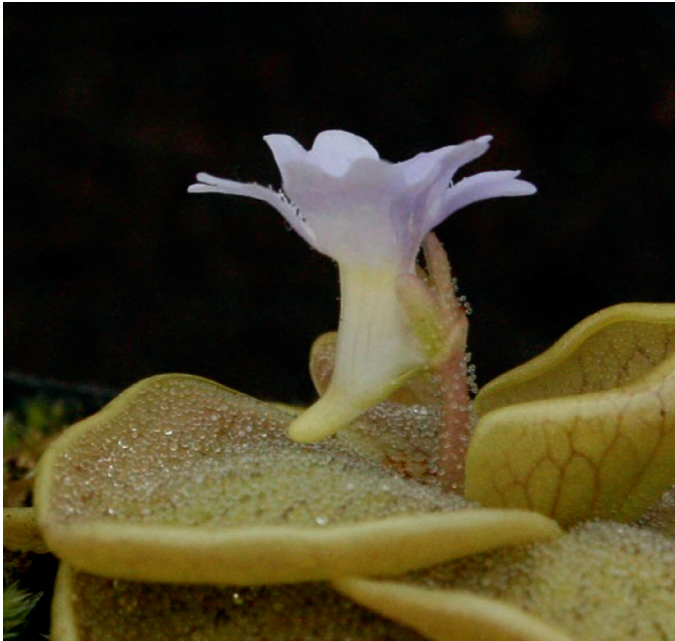
Figure 6: Pinguicula nahuelbutensis . Lateral view of a flower with pale violet corolla lobes and a white to light yellowish tube (in cultivation). The flower shows almost no venation on the corolla or tube. The lobes of the calyx are divided almost to the base.