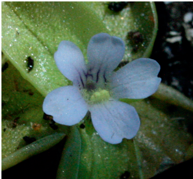
Figure 4: Pinguicula nahuelbutensis . Front view of a flower. The yellow 2-parted palate is located at the base of the middle lobe of the lower lip. (photo from location “las turberas” in the Nahuelbuta National Park, 26 January 2010).