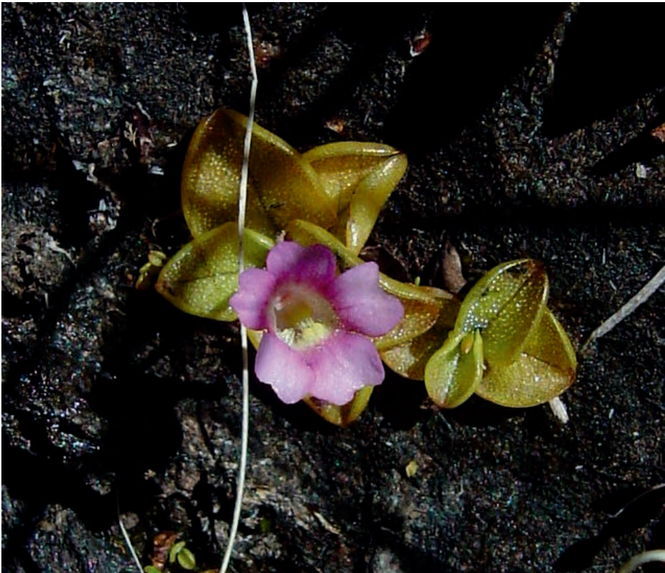
Figure 1: Pinguicula australandina . Plant in flower growing in volcanic debris at the edge of a typical alpine wet pasture in the Sierra Nevada, region Araucanía, Chile, at about 1670 m a.s.l. Note the almost isolobiate pink corolla with the yellow 2-parted palate located in the tube below the middle lobe of the lower lip.

wide, and covered with short, yellow subclavate hairs. Behind the palate are 3 rows of long, white, cylindrical hairs. The walls of the corolla tube are also clothed in long, white hairs. The conical spur is 2-3 mm long, obtuse or slightly pointed at the tip, light green and sometimes brownish-green towards the tube, and sparsely covered with short, stipitate glandular hairs. The seed capsule is ovoid.