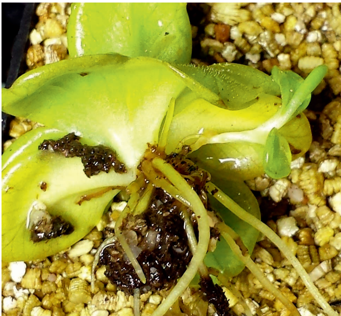
Figure 7: Pinguicula nahuelbutensis . Stolon with plantlet developing at the base of the leaf rosette (in cultivation).