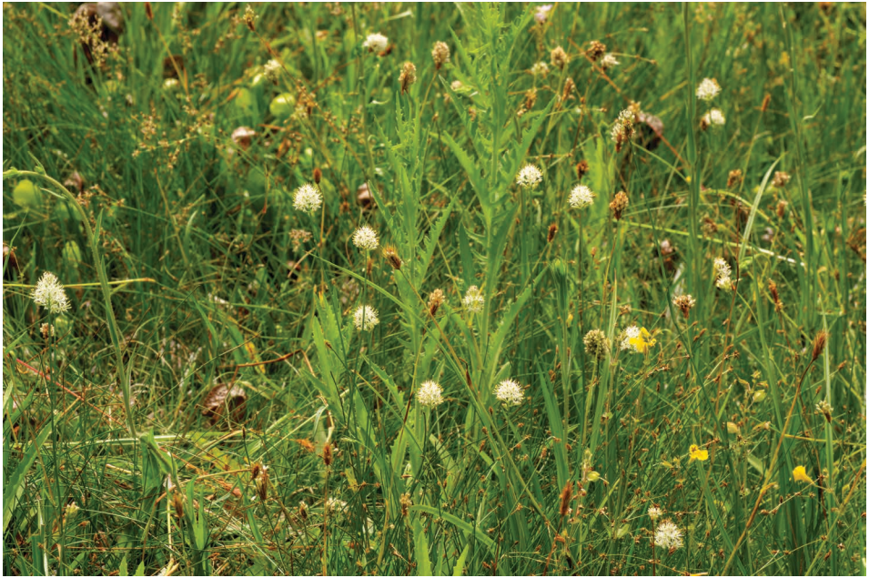
Figure 4: Tall flowering Triantha occidentalis subsp. occidentalis in Nevada County, California, on the western slopes of the Sierra Nevada. The large dried infructescences belong to Bistorta bistortoides .

bits of detritus stuck to them (seeds, dirt, etc.), none of them were observed to have what could be clearly identified as captured insects.