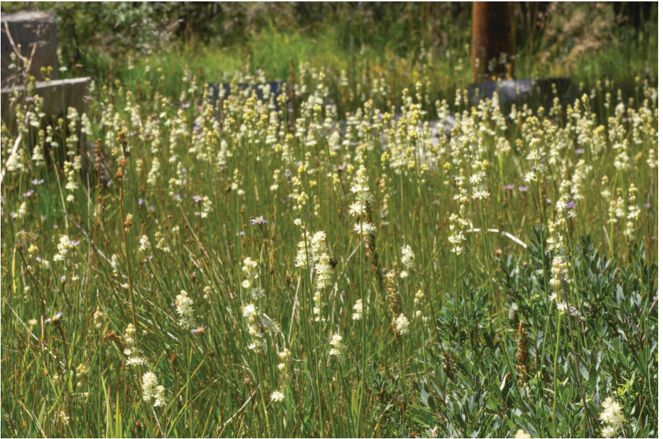
Figure 5: A dense population of Triantha occidentalis subsp. occidentalis in Nevada County, California, on the eastern slopes of the Sierra Nevada.