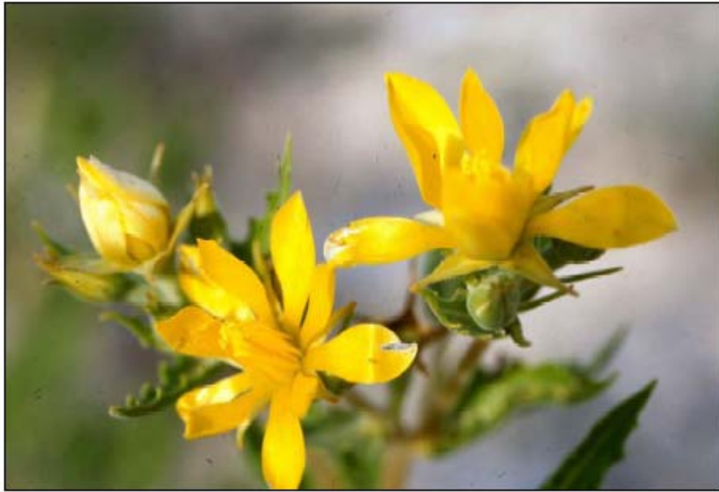
Golden Blazing Star

Packet Prepared by Courtney Hurst Natural Areas Program Colorado State Parks August 11, 2006