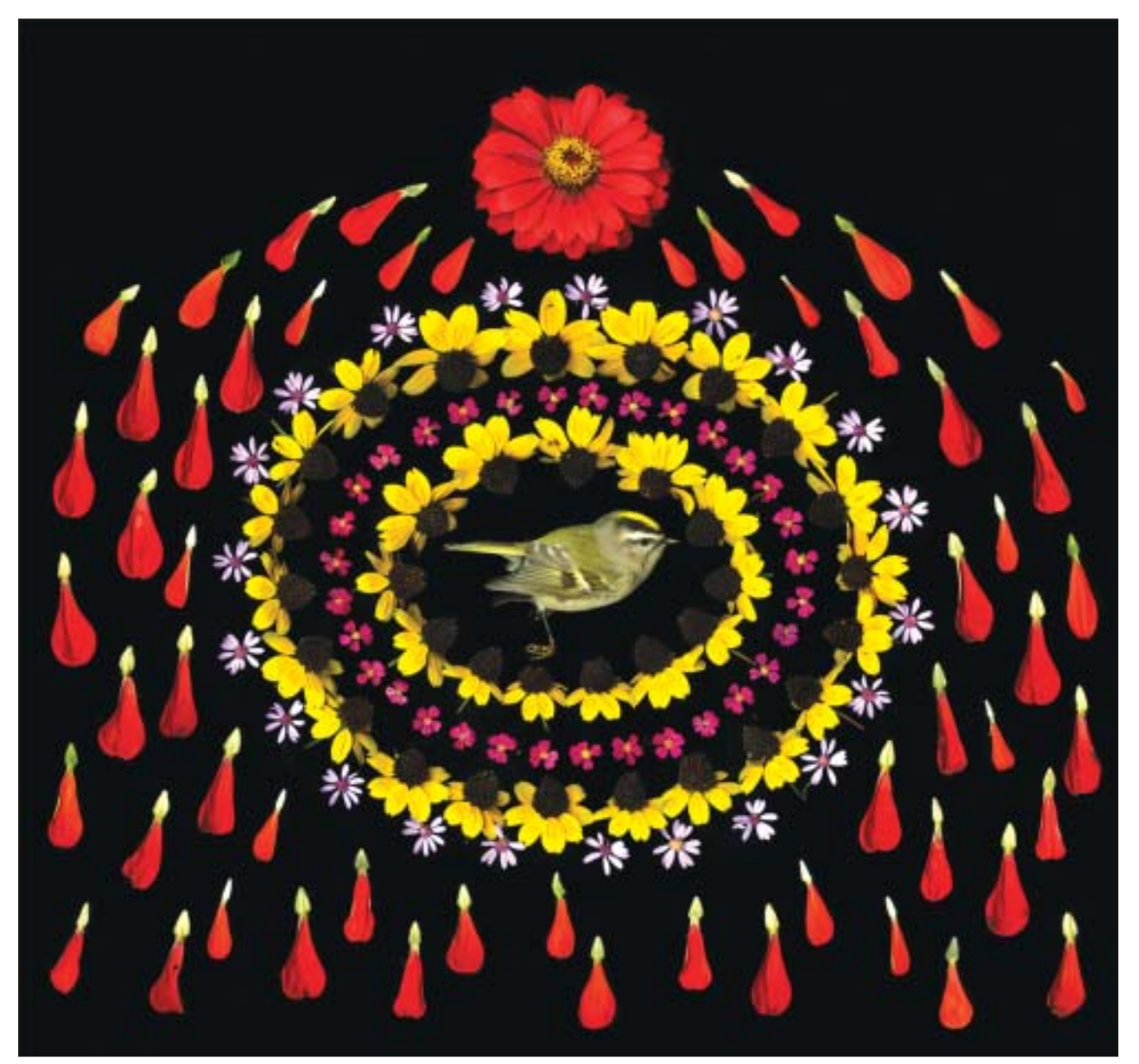
"Golden Crowned Kinglet," pigmented ink on paper by Portia Munson will be on display for the "Whale Oil to Whole Foods Part 2" exhibit at the Agroforestry Research Center in Acra opening on July 8.