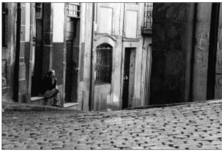
"Porto," photograph by Allen Reich.

Since 1976, Reich has been working as a designer and builder of furniture and cabinets. He uses mostly native hardwoods in his work. His designs reflect the influence of early 20th century furniture makers including those of the Arts and Crafts, Art Deco