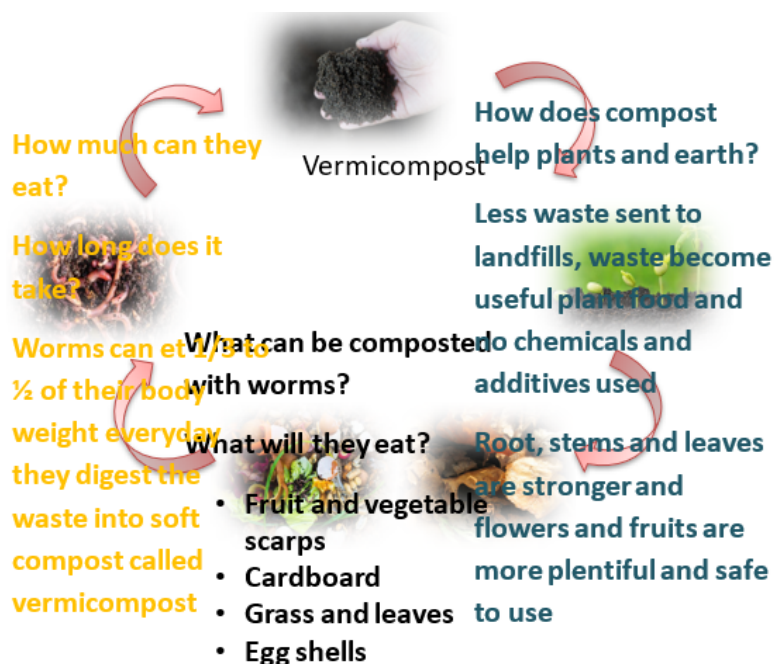
Figure 2: Advantages of composting with worms.