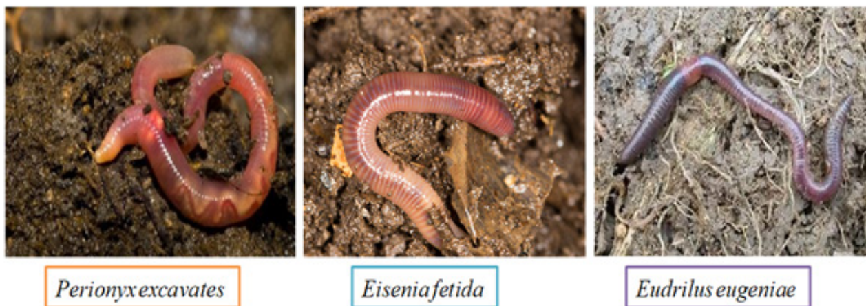
Figure 1: Most popular earthworms that have been successfully employed in India to prepare vermicompost.