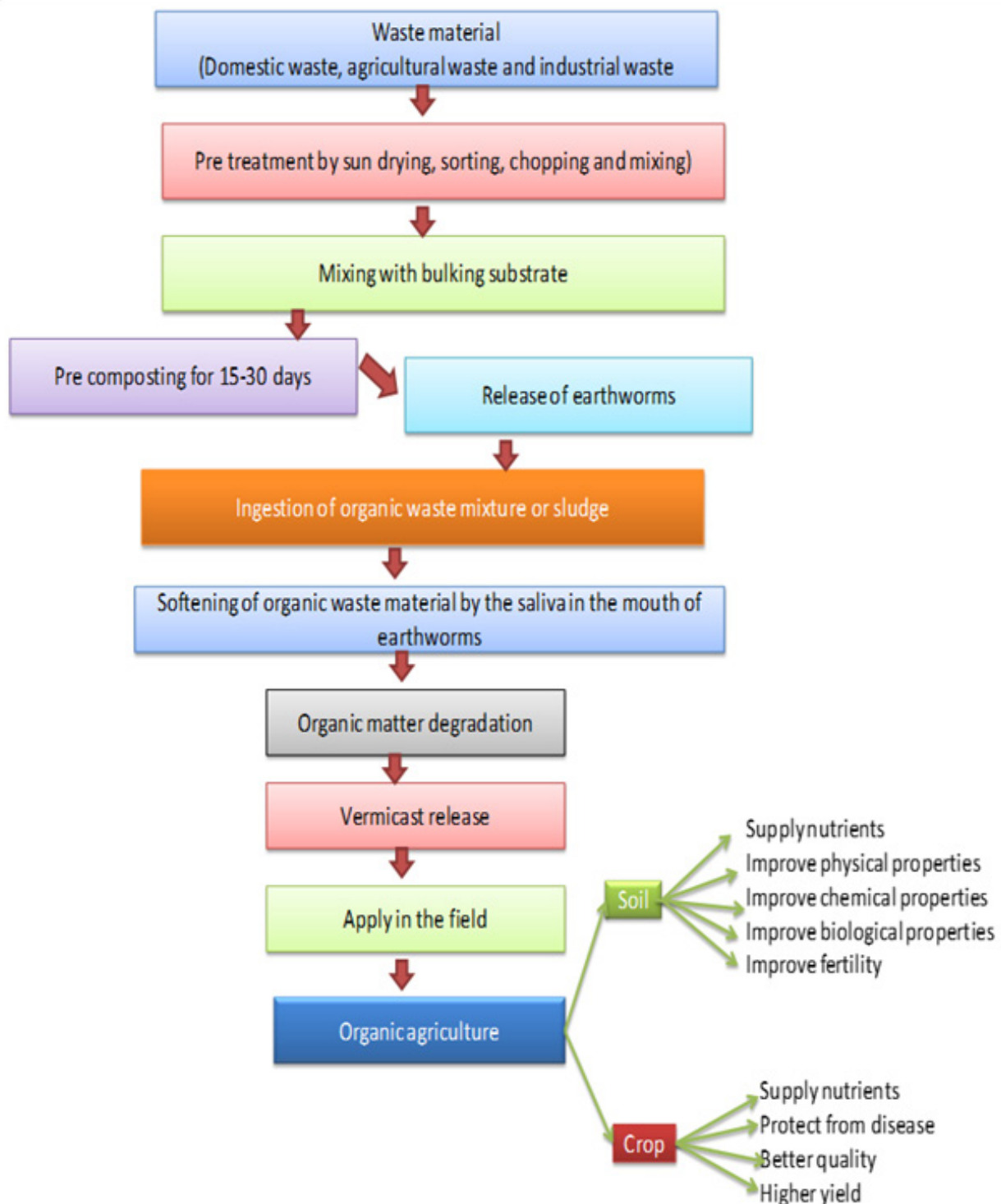
Figure 4: Overview of vermicomposting and related advantage.

Bedding material/organic residues: Any material that offers the worms a habitat that is reasonably stable is considered bedding. Peat moss, corn silage, hay, straw, paper mill sludge, sawdust, shrub trimmings, shredded plant stalks, corn stalks, and corn cobs are a few of the bedding materials that are frequently used. As the worms breathe via their skins and need a moist environment to dwell in, bedding materials should have a high moisture absorp-