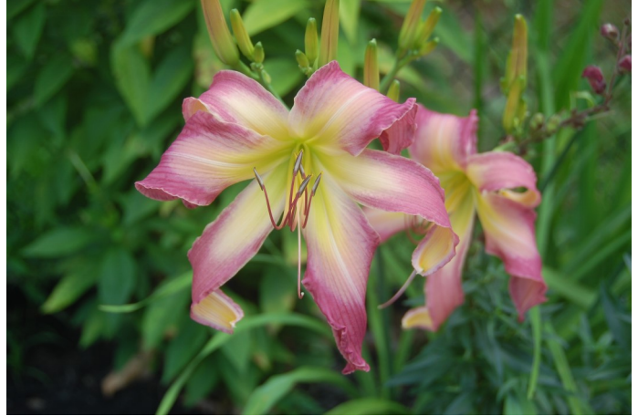
2011 North Wind Dancer (Schaben 2001)