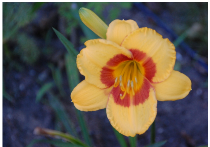
2005 Fooled Me (Reilly-Hine 1990)