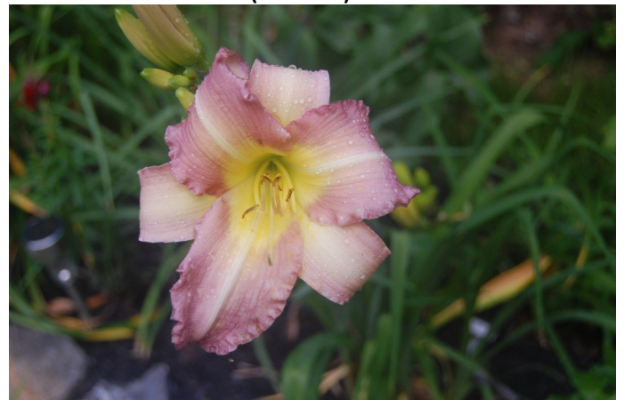
1973 Lavender Flight (Spalding 1963)