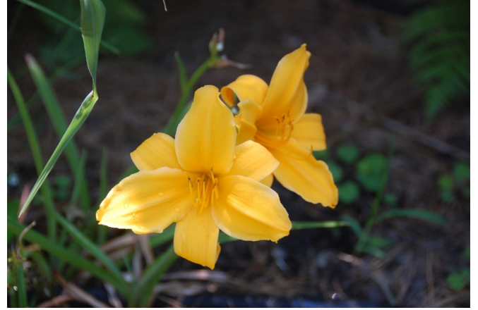
1961 Playboy (Wheeler 1954)