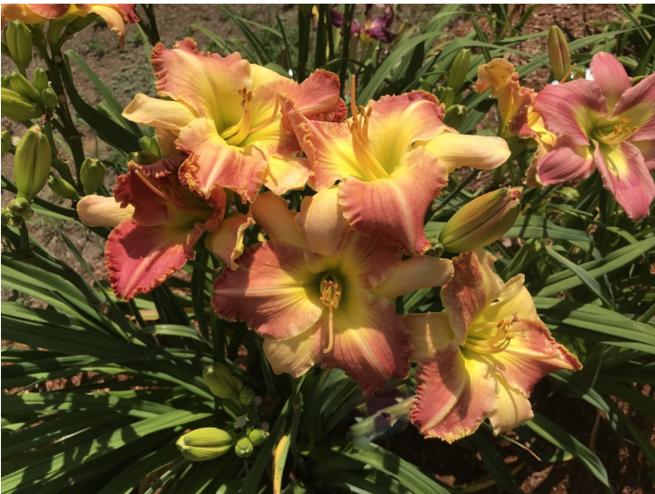
'Clown Parade' (Selman 2006)