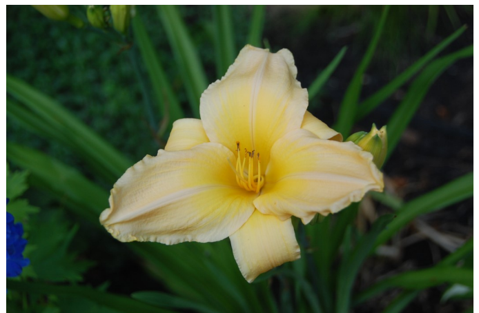
1975 Clarence Simon (Macmillen WB 1966)