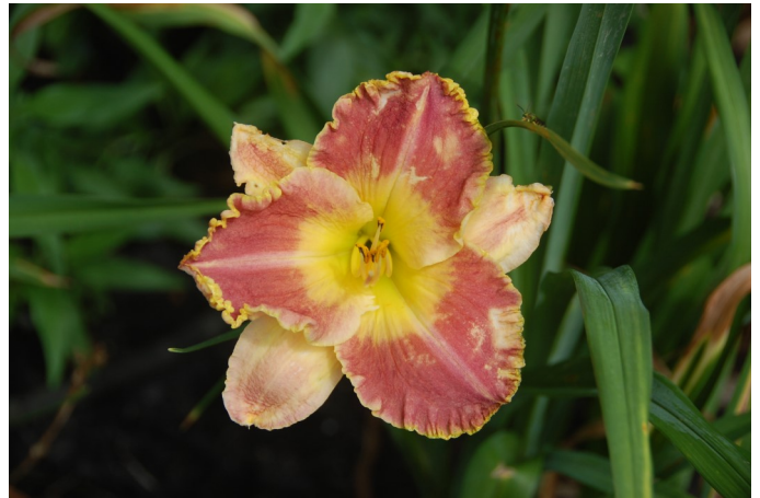
2001 Ida's Magic (Munson I 1988)