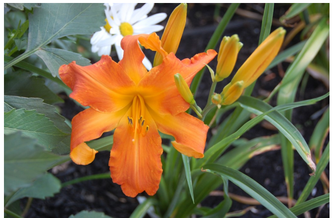
2003 Primal Scream (Hanson C 1994)