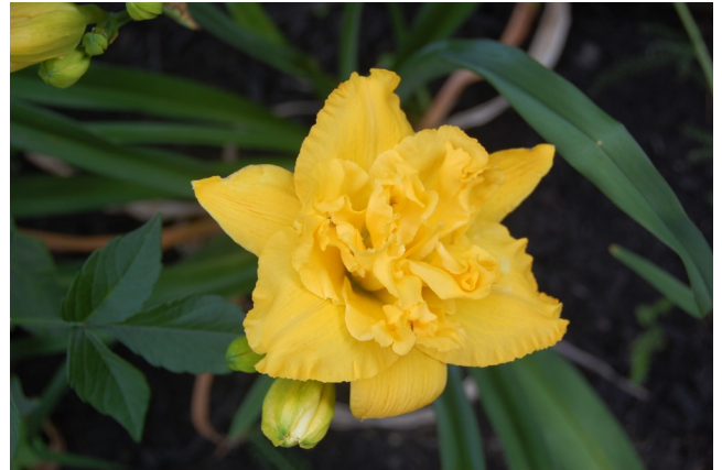
1991 Betty Woods (Kirchhoff D 1980)