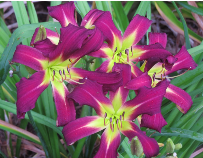
'Small World Red Finch' (Miller 2012)

Kindly submit all to both editor email addresses.