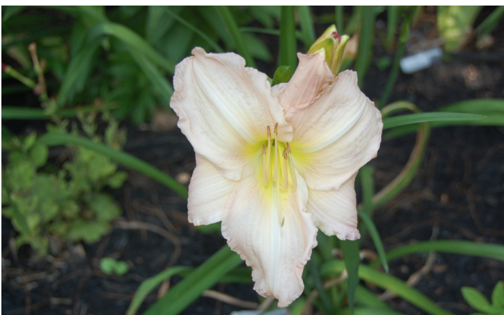
1984 My Belle (Durio 1973)