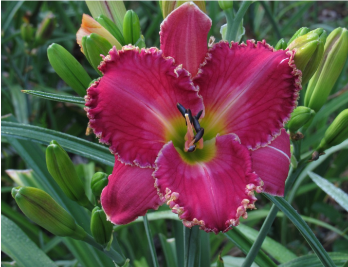
H. 'Cherry Music' (Church 2013)

Coordinating photos are placed above daylily names & are courtesy of the hybridizers unless otherwise indicated.