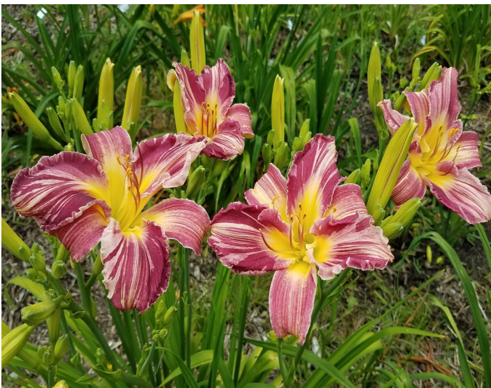
H. 'Yankee Pinstripes' (Howard 2013)