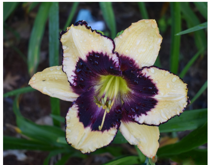
'Greywoods Road to Mecca' (Wilkinson 2004)