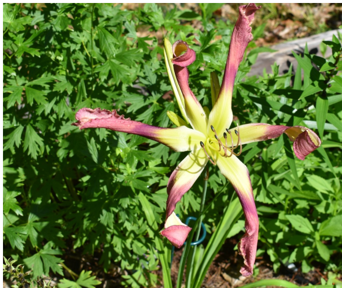
'Whip City Walks on Air' (JONES L 2017)

4083 Watson Road South, RR1 Puslinch, Ontario Canada NOB 2J0