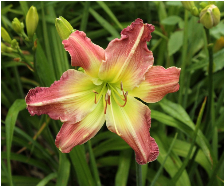
H. 'Brookside Pink Panther'