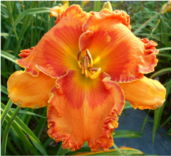
H. 'A Man Called Trout' (Longton 2018 )