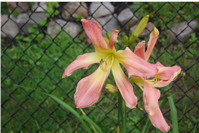
2014 Webster's Pink Wonder (Webster-Cobb 2003)