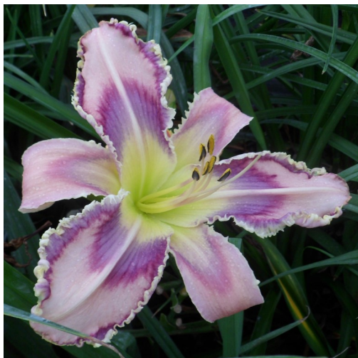
2018 Entwined in the Vine (Emmerich 2007)