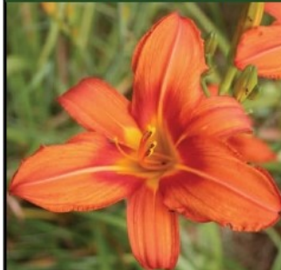
LABOR DAY HEAT WAVE (Sobek 20)