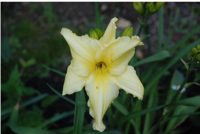
1974 Winning Ways (Wild 1957)