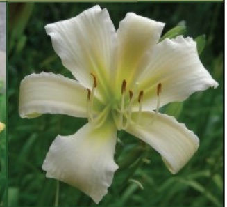
ALINA (Huben 21)