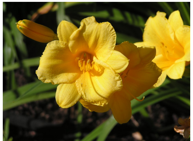
1985 Stella de Oro (Jablonski 1975)