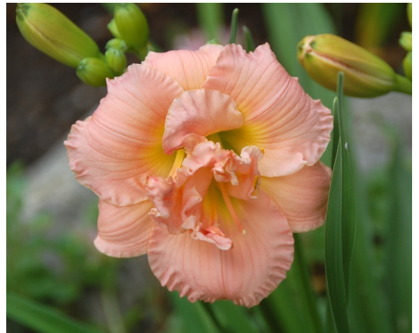
1993 Siloam Double Classic (Henry P 1985)