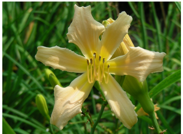
H. 'Helicopter' (Huben 2013 )