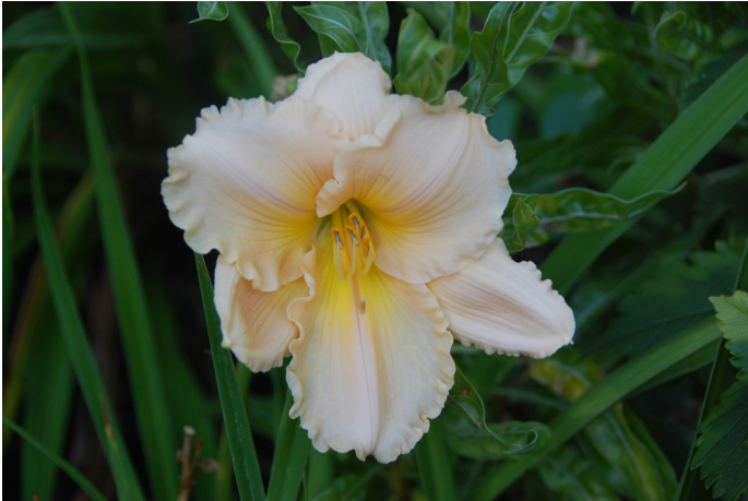
1990 Fairy Tale Pink (Pierce C 1980)