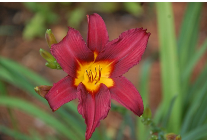
1952 Potentate (Nesmith 1943)