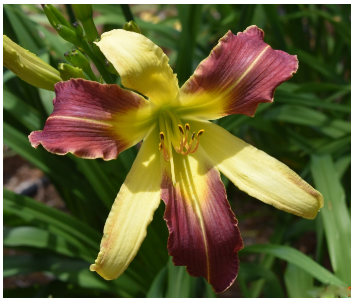
'Harpie Lady' (Gossard 2008)