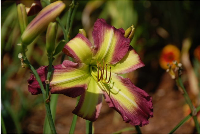
2016 Rose F. Kennedy (Doorakien 2007)

Stout Medal Winners Parade — 2016 –2020 the last decade