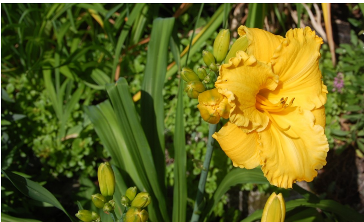
2002 Bill Norris (Kirchhoff C 1993)