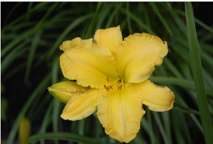
1972 Hortensia (Branch 1964)