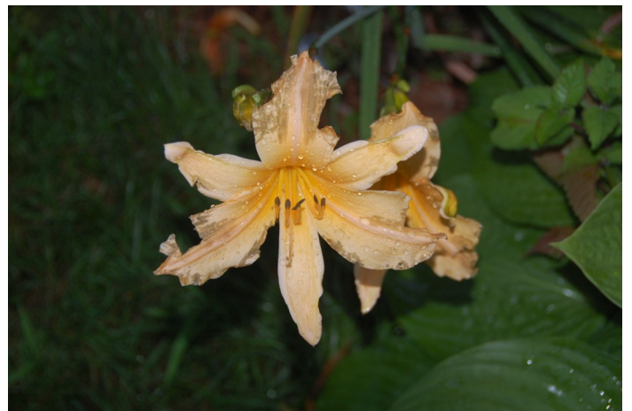
1963 Multnomah (Kraus 1954)