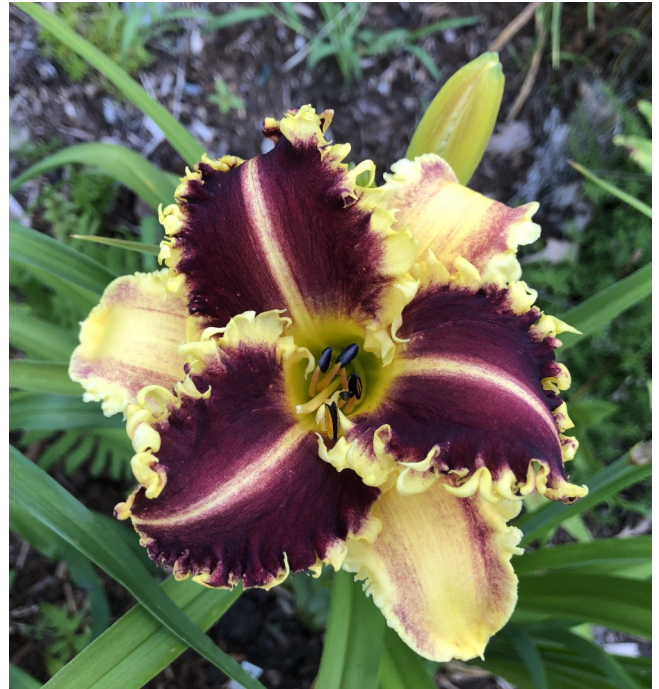
H. 'Zollo Omega' (Conway C 2019)