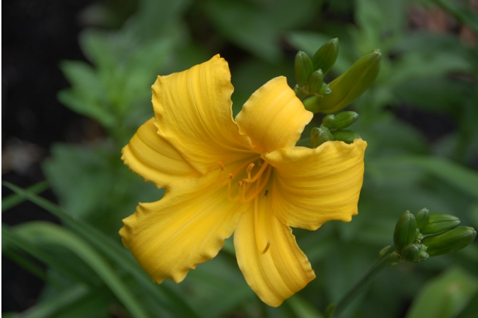
1970 Ava Michelle (Flory WB 1960)