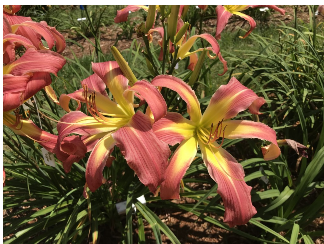
'Supergirl' (Gossard 2011)