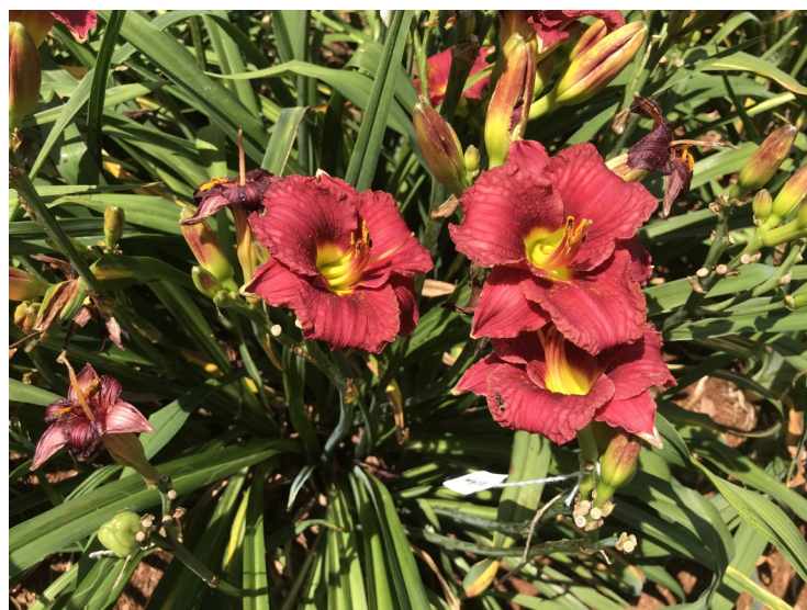
'Little Bo Peep Diploma' (HANSEN C 2010)