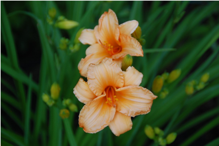
1980 Bertie Ferris ( Winniford Ury 1969)