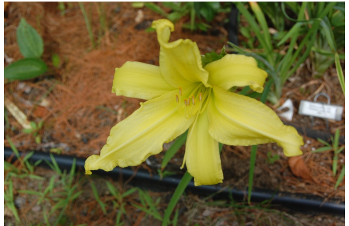
1951 Painted Lady (Russel 1942)