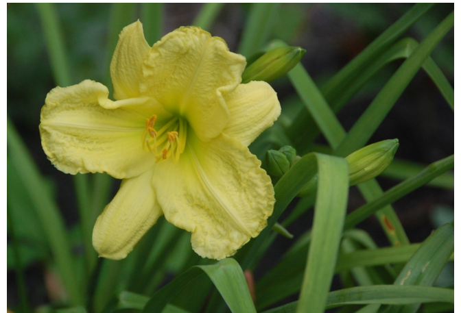
1971 Renee (Dill 1962)