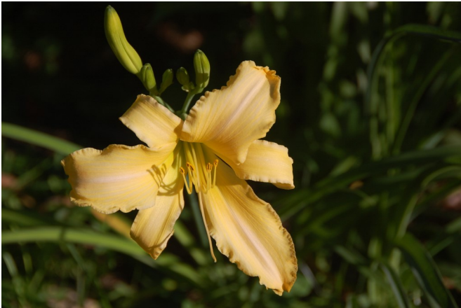
1960 Fairy Wings (Lester 1952)