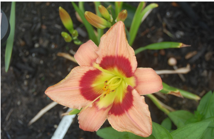
2012 Carnival in Mexico (Santa Lucia 2000)