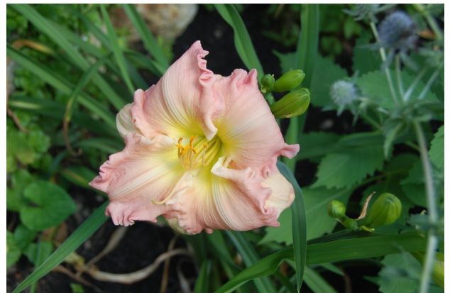
1995 Neal Berrey (Sikes 1985)