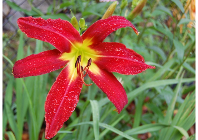
2017 Heavenly United We Stand (Gossard 2009)