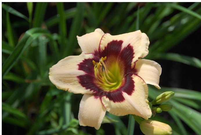
2004 Moonlit Masquerade (Salter 1992)