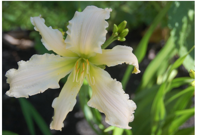
2013 Heavenly Angel Ice (Gossard 2004)