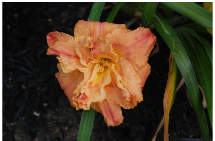
2015 Dorothy and Toto (Herrington K 2003)