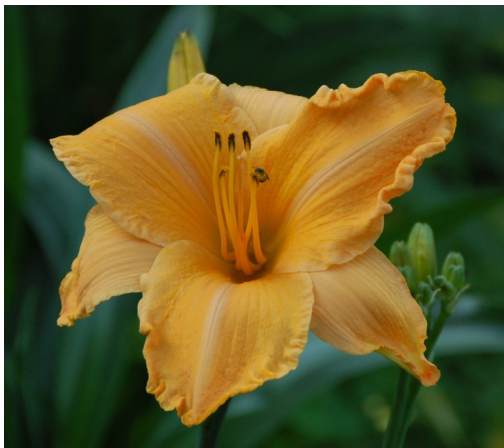
1982 Ruffled Apricot (Baker S H 1972)