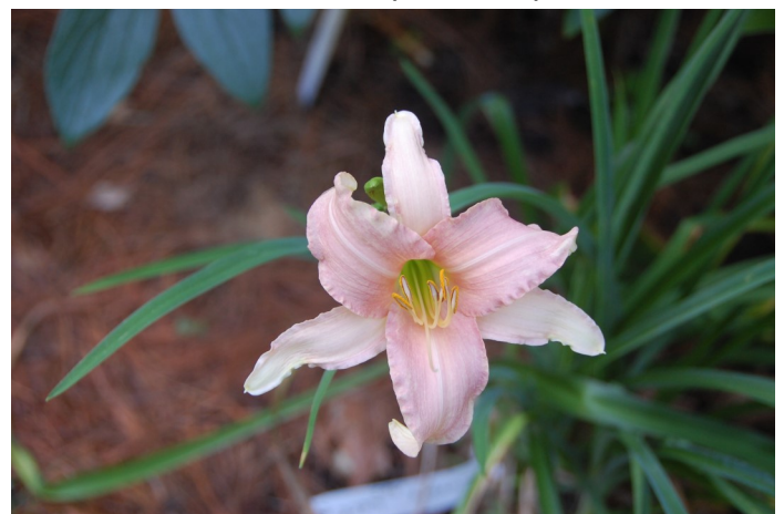
1965 Luxury Lace (Spalding 1959)