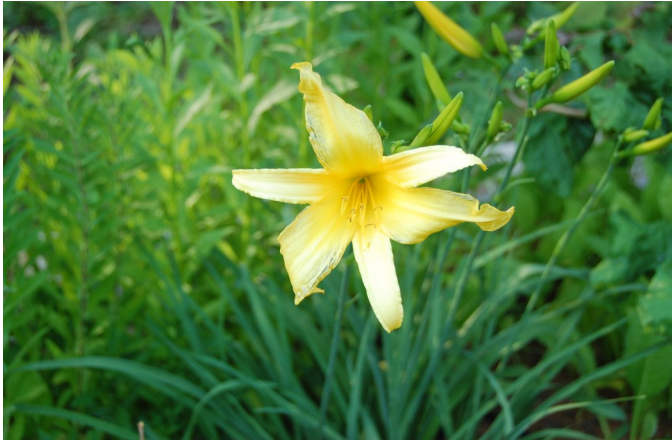
1950 Hesperus (SassH P 1940)