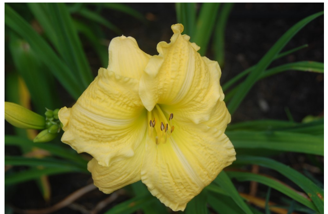
1983 Sabie (MacMillen 1974)