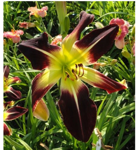
2019 Scarlet Pimpernel (Ripley 2006)