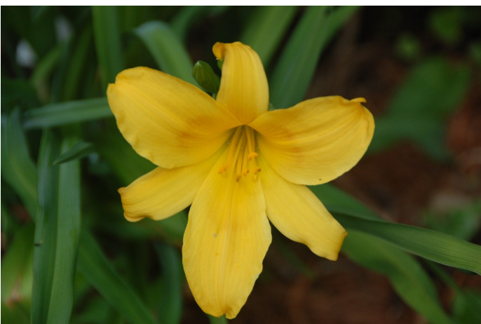
1954 Dountless (Stout A 1935)