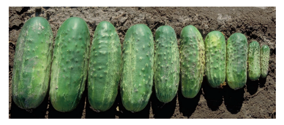
Fig. 2 American pickling cucumber graded from right to left based on a diameter scale of 1 (0-25 mm) to 3 (39-51 mm)