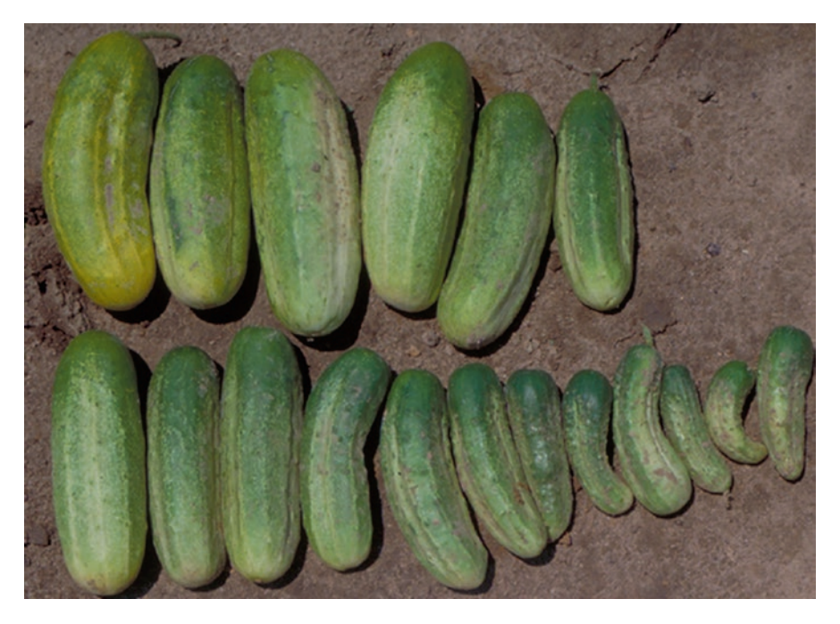
Fig. 3 'Snow's Pickling' an early American cultivar (ca. 1905) with poor shape, black spines and light skin color

middle eastern Beit Alpha, and Oriental trellis), there is variation in fruit morphology, growth habit, and disease resistance. Unlike some of their more colorful relatives, cucumbers have few vitamins and minerals in their fruit (Table 2), with the exception of lutein, a carotenoid (Perry et al. 2009; Granado et al. 2003). To date, no studies have examined the variation for lutein content among the cucumber market types. However, work has been done on the inheritance of beta-carotene in cucumber and germplasm released (Cuevas et al. 2010; Staub et al. 2011). In general, cultivated cucumber fruit have few spines, a large mesocarp, bitterfree fruit, and few or no seeds. This is in contrast to its wild relative, C. s. var. hardwickii that has small and bitter fruits, a large seed cell, and many seeds citation (Walters et al. 1996). More than 150 single-gene traits have been described in cucumber, and molecular markers are being developed for use in selection (Table 3). For a more comprehensive list of cucumber genes and sources, see the Cucurbit Genetics Cooperative list (http://ars.usda.gov/sotheast-area/charleston-sc/vegetable-research/docs/cgc).