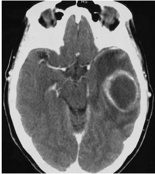
Fig. 1. Initial computed tomogram with injection showing a lesion of the left temporal ring that is inducing a midline shift.

septic emboli through a right-to-left shunt and subsequent brain abscess. 1 As many as 19–39% of patients with HHT-associated brain abscesses die, while less than 8% of patients with brain abscesses die in the general population. 3,4