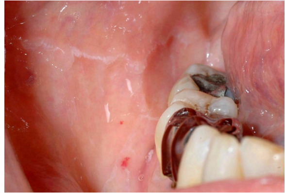
Fig. 3. Oral telangiectasia on the mucosa of the cheek in the area of the right mandibular molars.

found in the brain; no other port of entry was apparent; and the patient had untreated pulmonary arteriovenous fistulas. 3,4 The cumulative risk of endocarditis resulting from bacteraemia caused by daily activity is far greater than the risk of endocarditis resulting from a single dental procedure, 5,6 so by analogy with infective endocarditis, the effect of the recent oral procedure will never be ascertained, even if the causal relation seems plausible.