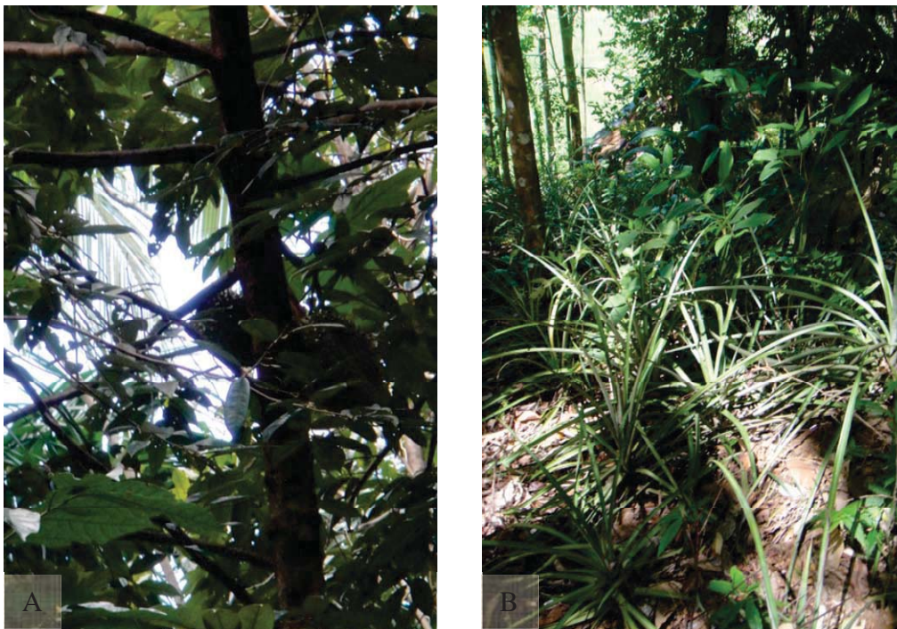
Fig. 3. One of the fruit trees (A: Durio zibethinus ) and agricultural crops (B: Ananas comosus ) planted in rainforestation areas.

The continuous efforts for reforestation in the country had accounted to 352,000 ha of planted forests in 2010 that corresponded to 5% total forest area. It was an increase from 302 000 ha in 1990, 327 000 ha in 2000, and 340 000 ha in 2005. Accordingly, the annual change rates of planted forests were 0.80% from 1990 to 2000, 0.78% from 2000 to 2005, and 0.70% from 2005 to 2010. The report further indicated that 99% of trees in plantations were introduced species (FAO-FRA, 2011).