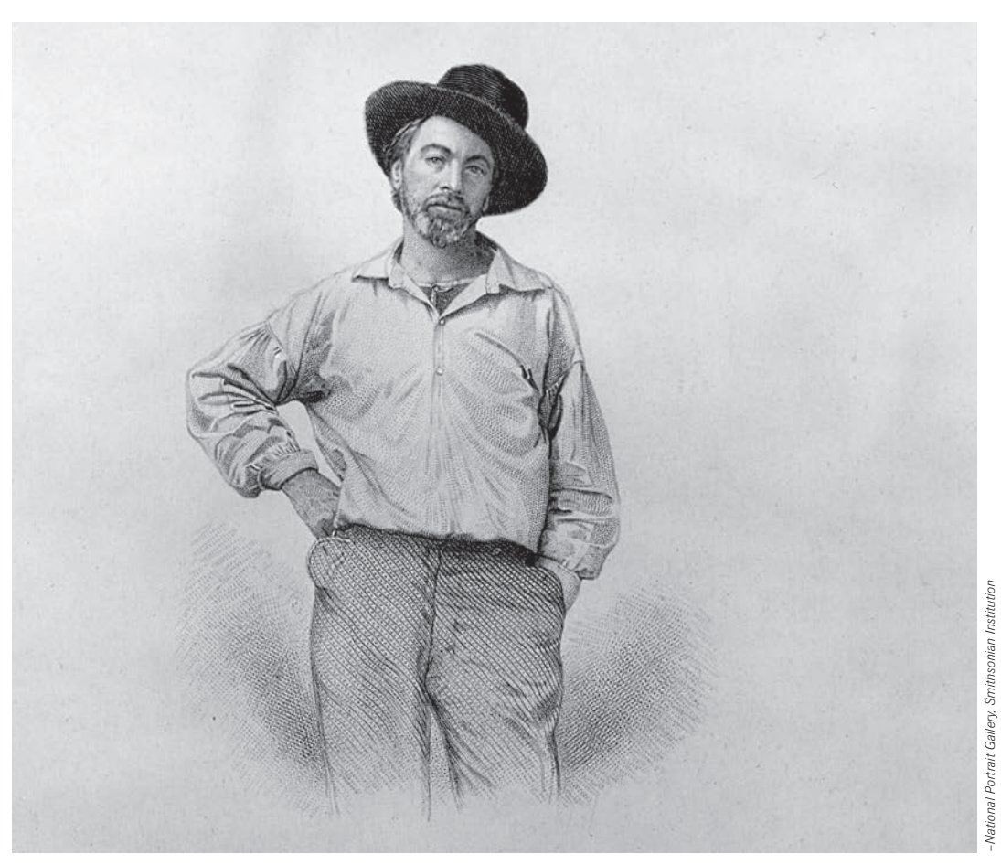
Portrait of Walt Whitman by Samuel Hollyer that appeared in the first edition of Leaves of Grass , 1855.

The fifteenth year of a congressionally mandated initiative for the preservation of brittle books and serials was completed in 2003.