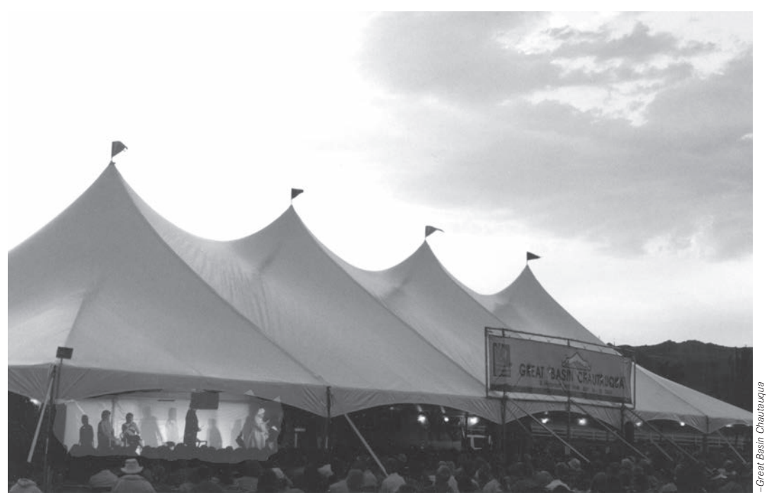
Chautauqua performance in Nevada.

trains youth in volunteerism and philanthropy. The Georgia Humanities Council and the Indiana Humanities Council both hold annual statewide leadership forums.