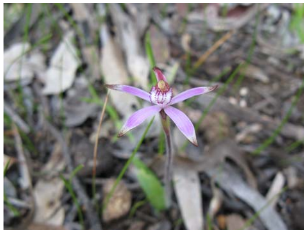
Caladenia hirta subsp. rosea