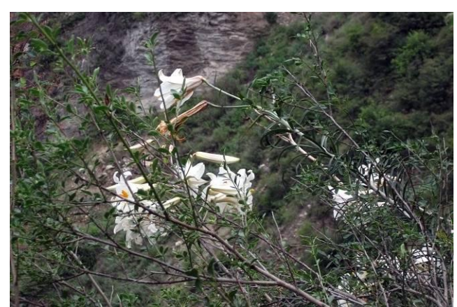
Lilium regale Maoxia