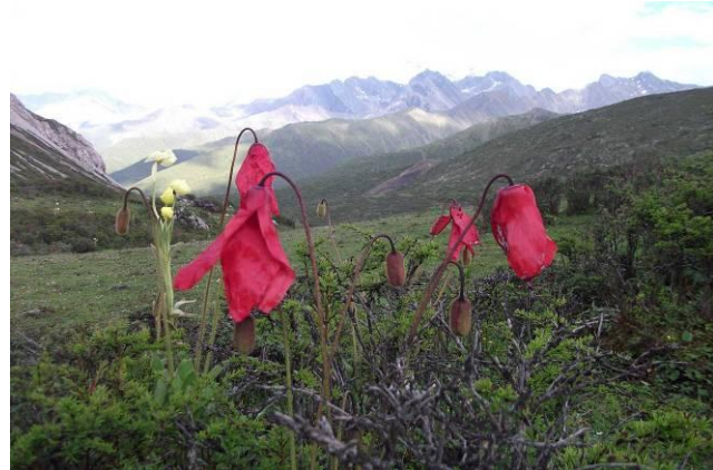
Gonpo at home Meconopsis punicea Huanglong La