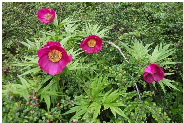
Paeonia veitchii - Wolong