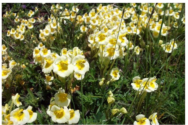
Pedicularis cranolopha Songpan