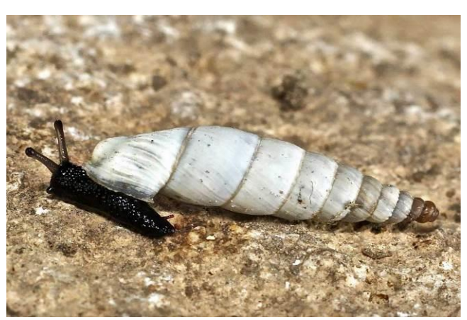
Endemic snail Albinaria virgo by Alan Outen