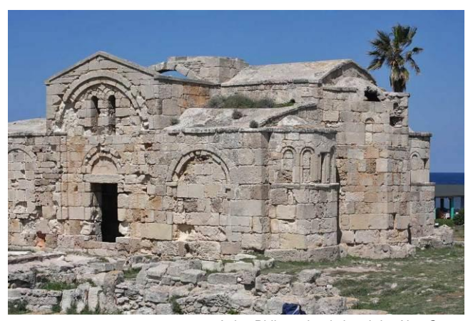
Agios Philon ruined church by Alan Outen

Setting up a personal profile at <a href="www.facebook.com">www.facebook.com</a> is quick, free and easy. The <a href="Naturetrek Facebook page">Naturetrek Facebook page</a> is now live; do please pay us a visit!