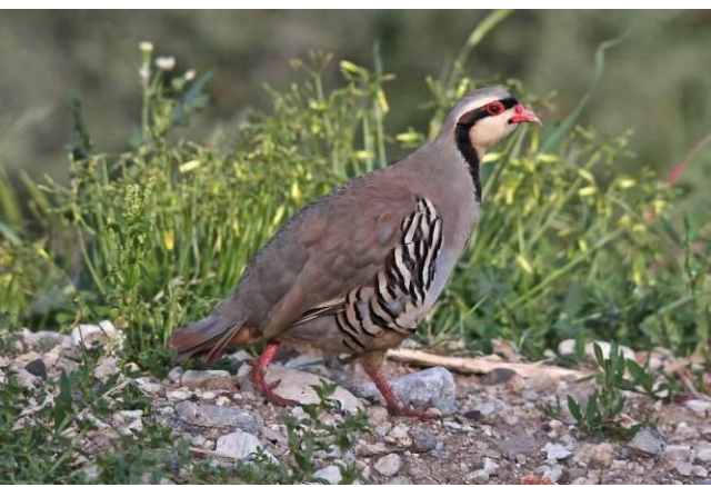
Chukar Partridge by Alan Outen