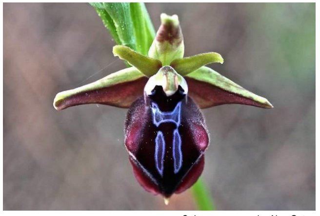
Ophrys mammosa by Alan Outen