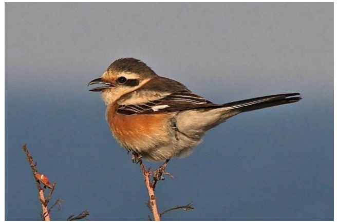
Masked Shrike by Alan Outen