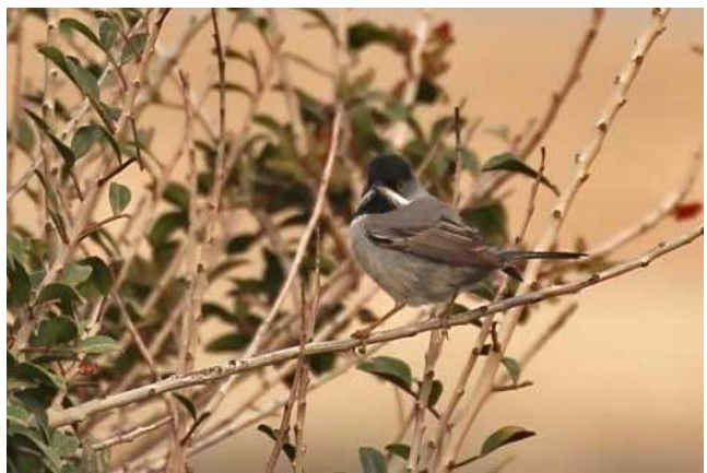
Cyprus Warbler by Andy Harding