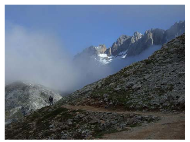
Above Fuente De