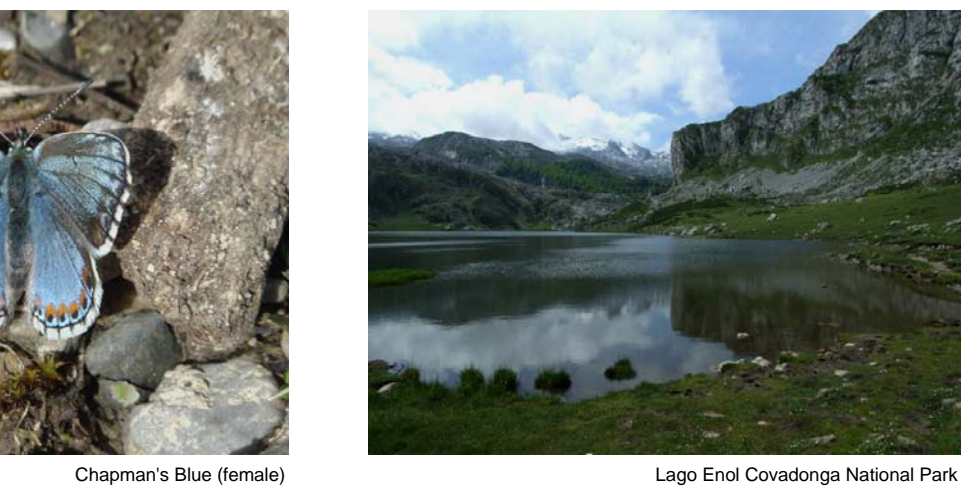
Chapman's Blue (female)