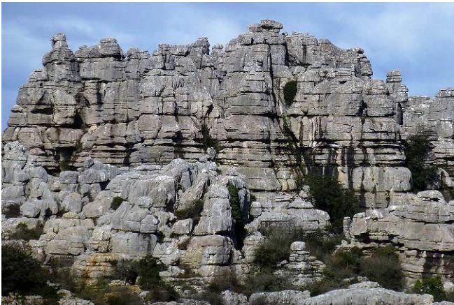
El Torcal de Antequera