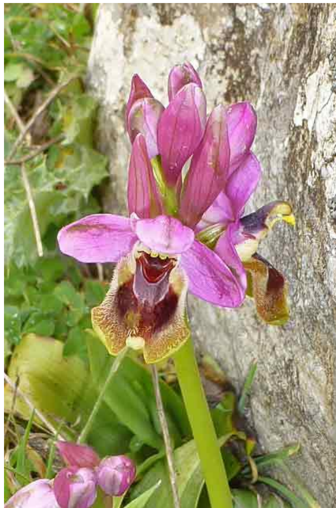
Sawfly Orchid - Ophrys tenthredinifera