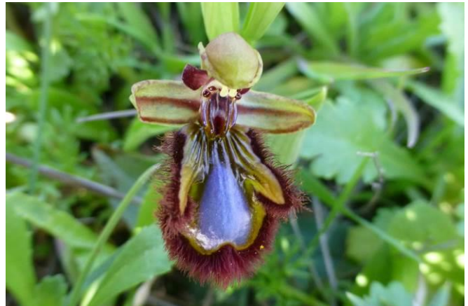
Mirror Orchid - Ophrys speculum