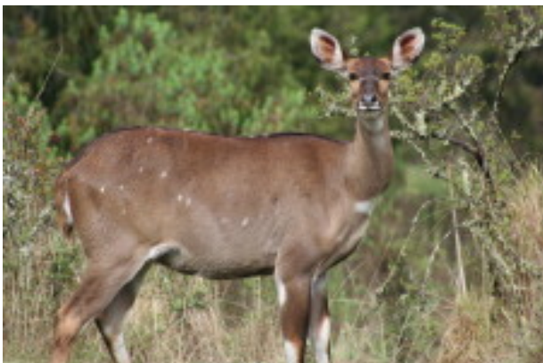
Mountain Nyala, female and male