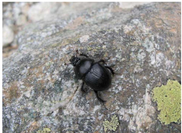
Geotrupes stercorarius - Dor Beetle