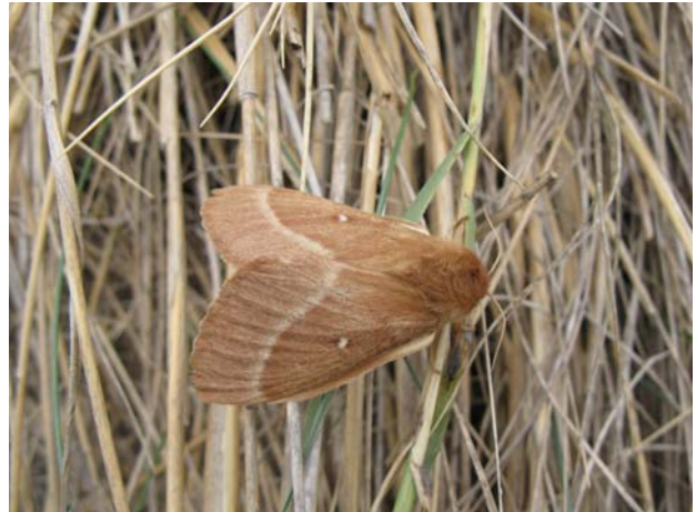
Grass Eggar - Lasiocampa trifolii