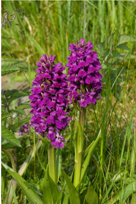
Dactylorhiza occidentalis – Western Marsh Orchid