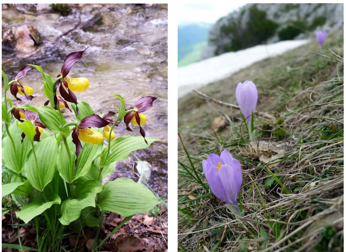
Lady's Slipper Orchids

Join the Naturetrek e-mailing list and be the first to hear about new tours, additional departures and new dates, tour reports and special offers. Visit <u>www.naturetrek.co.uk</u> to sign up.