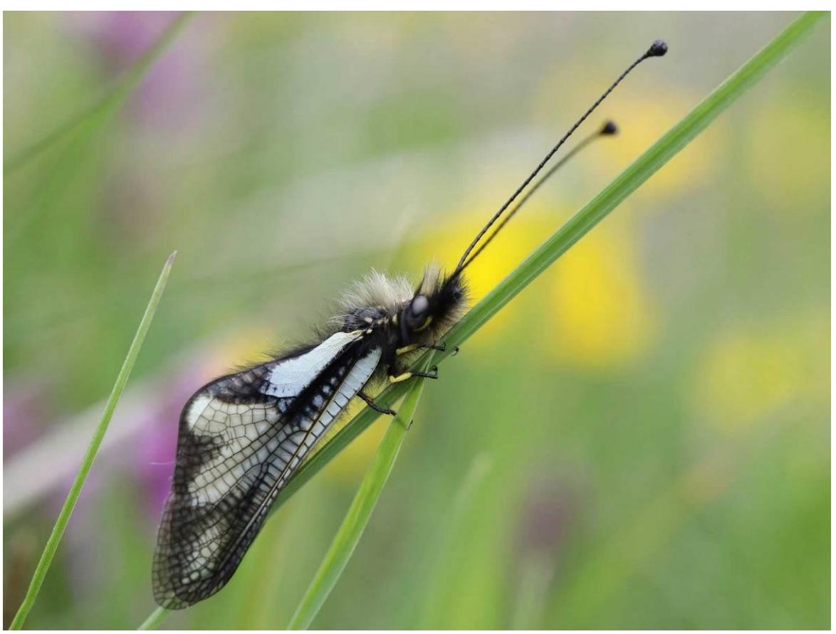
An Ascalaphid