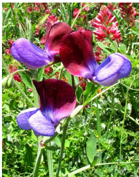
Sweet Pea ( Lathyrus odoratus )