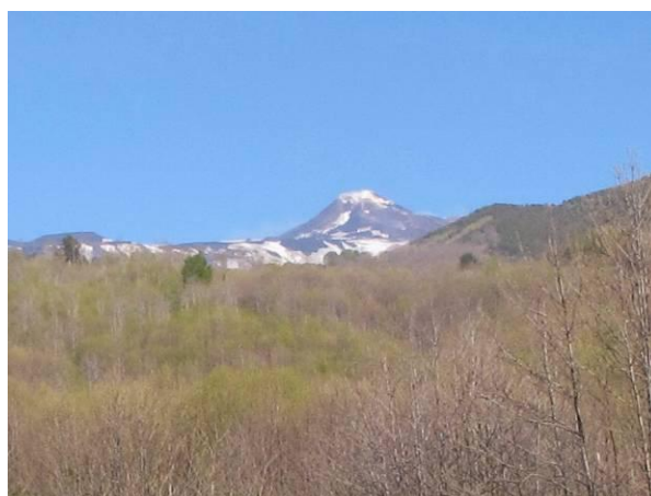
Mount Etna with Etna Birch ( Betula aetnensis )