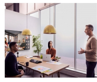
Meeting room solutions