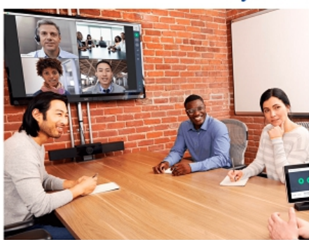
Workplace More collaboration