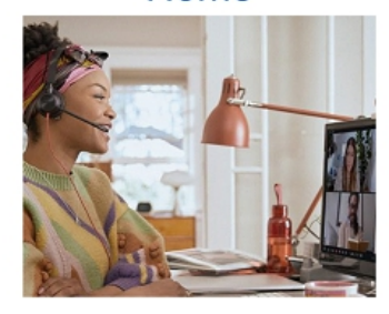
Personal audio and video