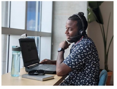
Work From anywhere

ITDMs upgrading conference rooms<sup>1</sup>