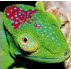
Furcifer timoni (female)

In total, 11 new chameleon species have been described since 1999.