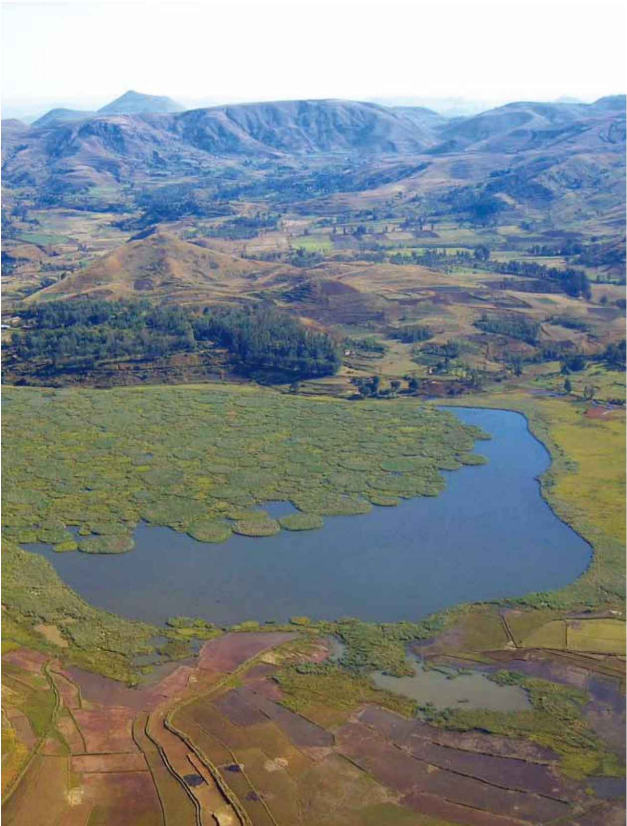
Antananarivo province, home to Madagascar's capital city and a number of new species discoveries, including the new orchid Polystachya clareae