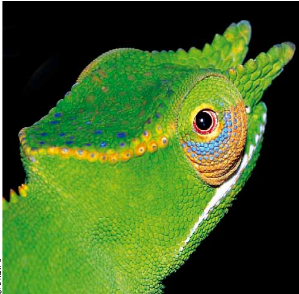
Furcifer timoni (male)