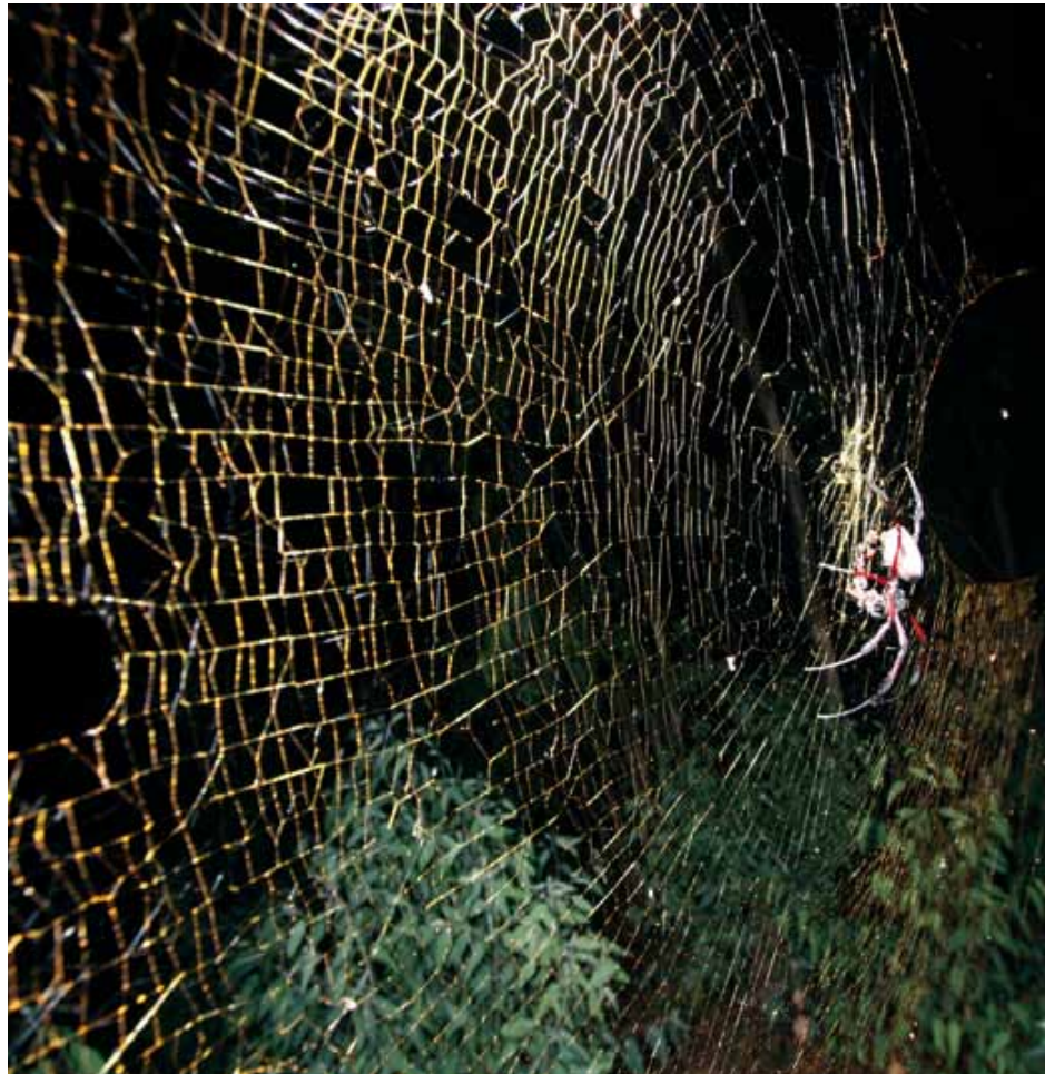
This photo shows the extreme difference in size of female and male orb-weaving spiders ( Nephila pilipes shown)