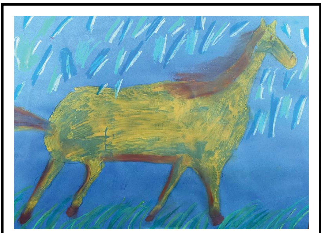
"Rainy Racehorse" - inspired by Edgar Degas