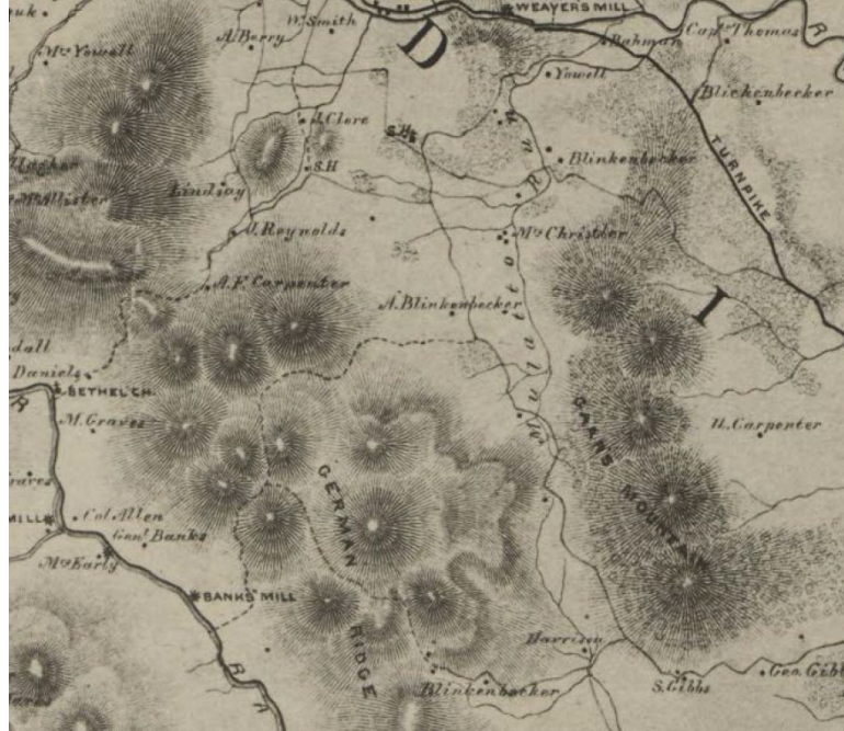
Map of Culpeper, Madison and Rappahannock; Virginia Chief Engineer's Office, 1864