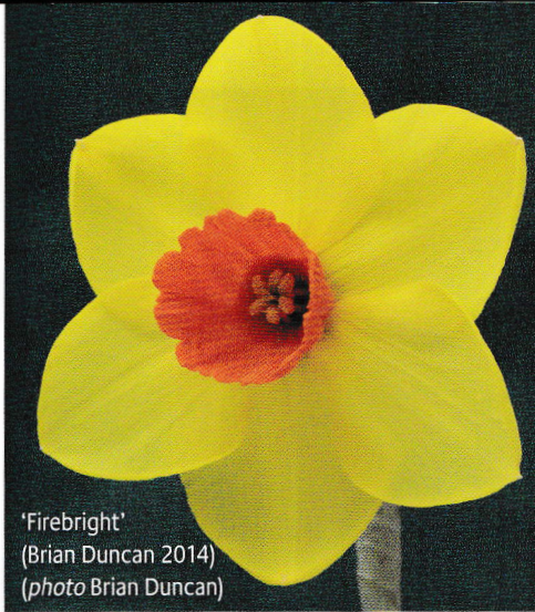
'Firebright' (Brian Duncan 2014)