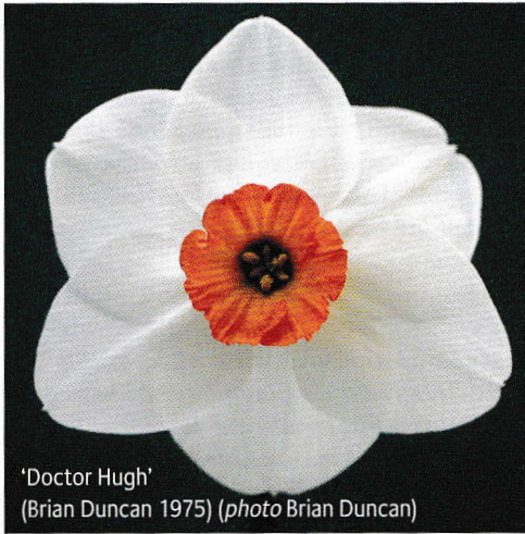
'Doctor Hugh' (Brian Duncan 1975)

'Ulster Bank' (1978) is still worth growing. 'Burning Bush' came along in 1987, followed by 'Garden News' in 1990. 'Jake' debuted in 1997, and its child 'Video Kid' followed in 2013.