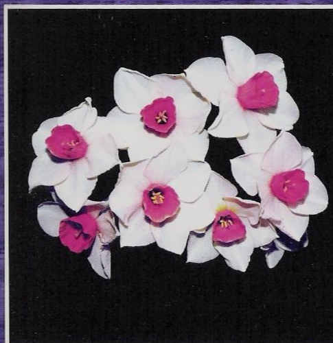
Work of Art