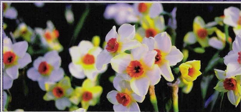
Work of Art