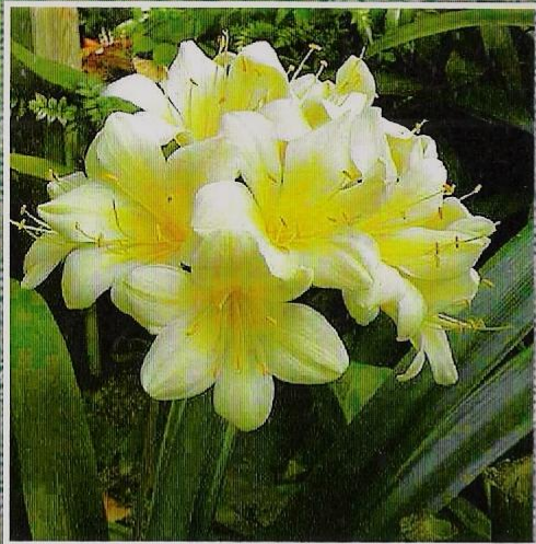
Clivia x kewensis 'Vico Yellow'