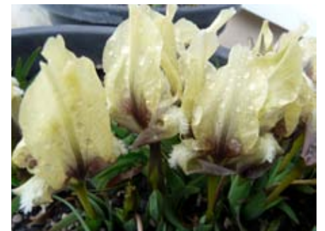
Iris suaveolens Yellow