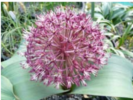
Allium karataviense ssp henrikii