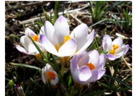
Crocus sieberi ssp sieberi