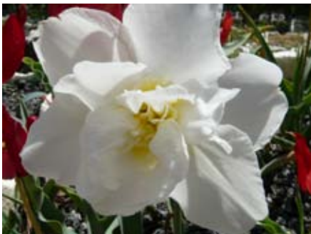
Narcissus poeticus Flora Plena