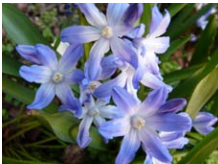
Chionodoxa gigantea "Blue Giant"