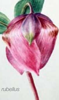
Calochortus albidus var. rubellus