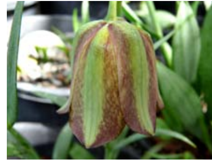
Fritillaria graeca ssp thessala