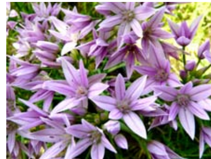
Allium uniflorum Chris Dwarf