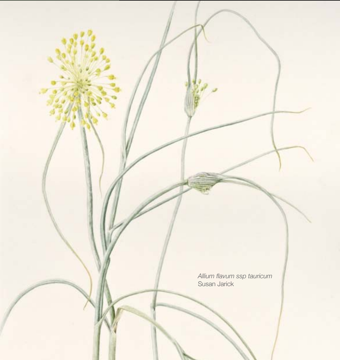
Allium flavum ssp. tauricum