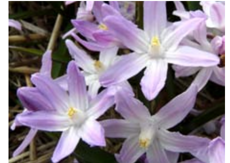
Chionodoxa Pink Giant