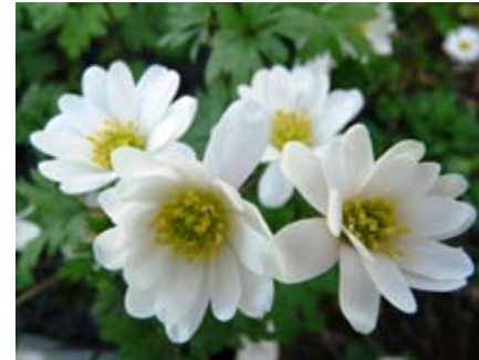
Anemone blanda White Splendour

rizehensis From Northern Turkey on the Black Sea Coast. A snowdrop of exquisite scale and proportion, with neat rounded flowers and narrow, deep green leaves. "Chinese bridge" shaped mark on inner segments reminiscent of G. "Straffan" . Naturally small bulbs FS/1st $5.00