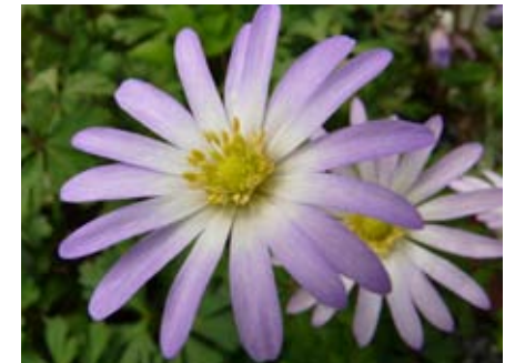
Anemone blanda Pink Form