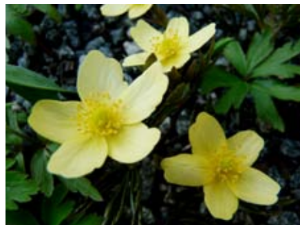
Anemone x seemanii