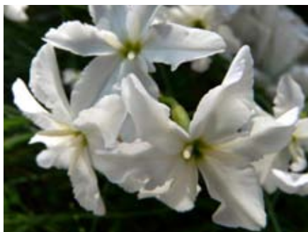
Leucocoryne ixiodes alba