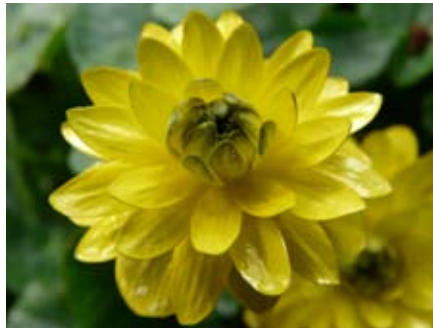
Ranunculus ficaria Double Gold