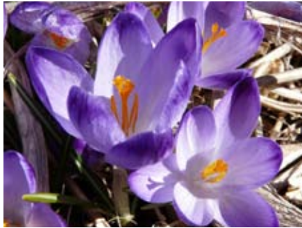
Crocus tommasinianus Pictus