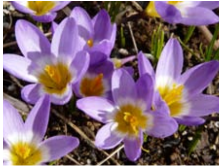
Crocus sieberi ssp. sublimis f. tricolor