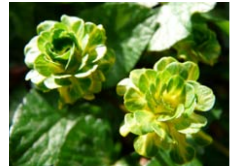
Ranunculus ficaria Green Petal