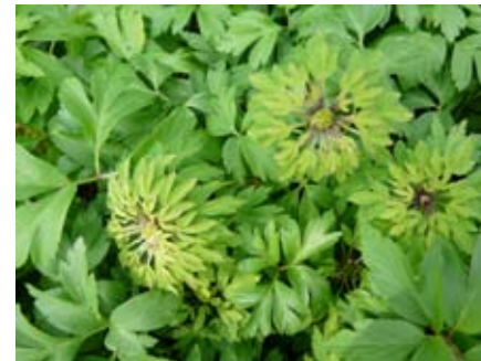
Anemone nemorosa 'Virescens'