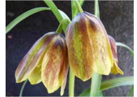
Fritillaria messanensis ssp gracilis