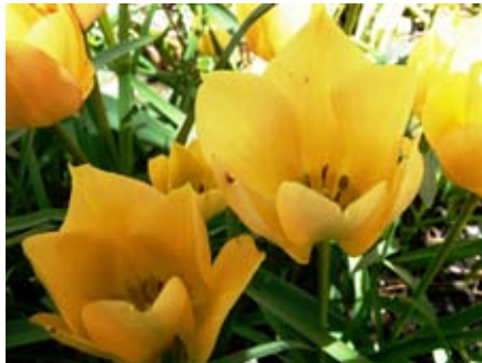
Tulipa batalinii Bronze Charm