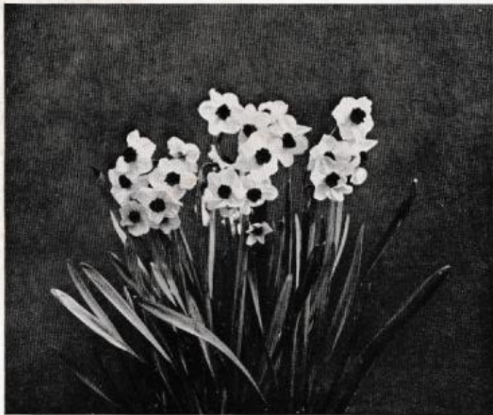
Fig. 4 POETAZ NARCISSUS, ELVIRA

Agnes Harvey , with white perianth and apricot-colored trumpet; Madonna , pure white; Alope , with a light yellow perianth; Primrose