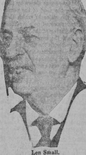
Gov. Len Small, who is held liable to Illinois for more than $1,000,000 which the state supreme court decided was illegally withheld by him.