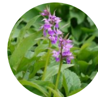
Hakusanchidori ( Dactylorhiza aristata )