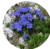
Miyamarindou ( Gentiana nipponica )