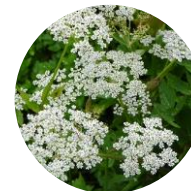
Hakusanbouhoo ( Peucedanum multivittatum )