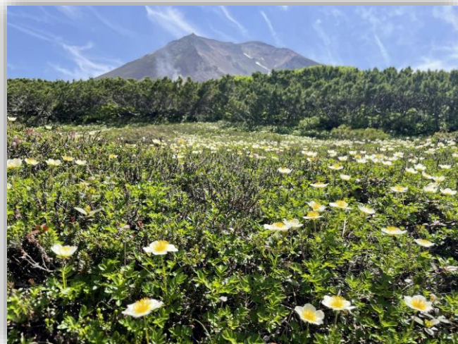
Aleutian Avens colony and Mt. Asahidake

Flowers of Aleutian Avens are getting falling in Sugatami Trail. You can see later flowers of Aleutian Avens and Phyllodoce, and Gentiana nipponica and Pennellianthus frutescens that bloom late in this season, now around the trail. We hope you enjoy your walking surrounded with various colors of beautiful alpine flowers.