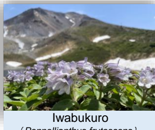
Iwabukuro ( Pennellianthus frutescens )