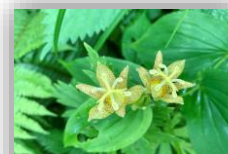
Tricyrtis latifolia var. makinoana