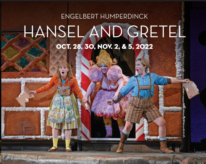
ENGELBERT HUMPERDINCK HANSEL AND GRETEL OCT. 28, 30, NOV. 2, & 5, 2022