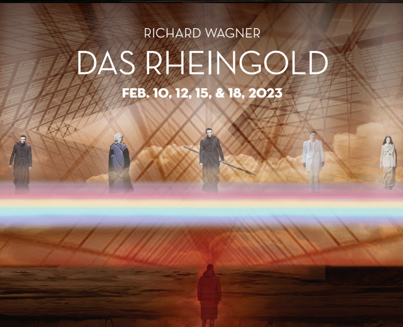
RICHARD WAGNER DAS RHEINGOLD FEB. 10, 12, 15, & 18, 2023