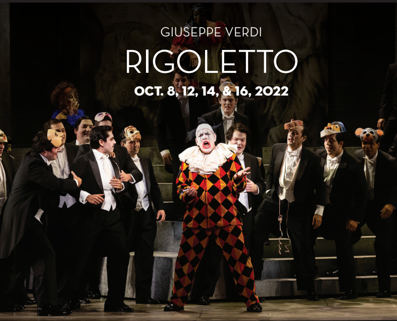
GIUSEPPE VERDI RIGOLETTO OCT. 8, 12, 14, & 16, 2022