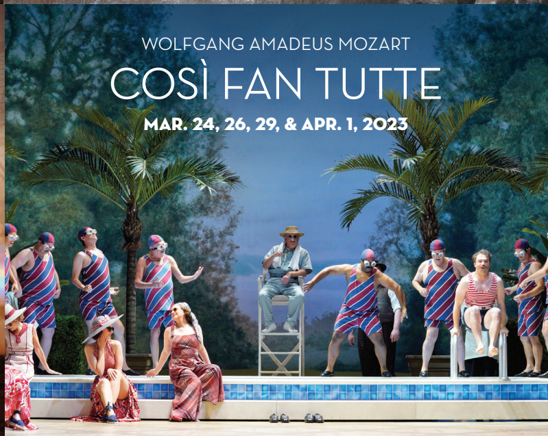
WOLFGANG AMADEUS MOZART COSÌ FAN TUTTE MAR. 24, 26, 29, & APR. 1, 2023