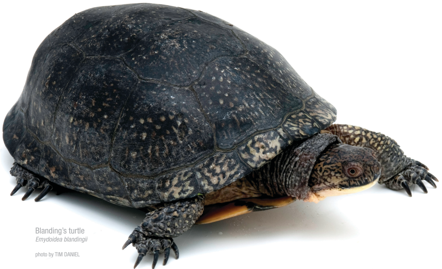
Blanding's turtle Emydoidea blandingii

WILDLIFE THAT ARE CONSIDERED TO BE ENDANGERED, THREATENED, SPECIES OF CONCERN, SPECIAL INTEREST, EXTIRPATED, OR EXTINCT IN OHIO