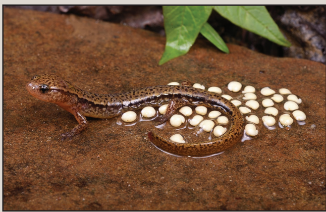
FIG. 1. Male Northern Two-lined Salamander ( Eurycea bislineata ) with a nest.