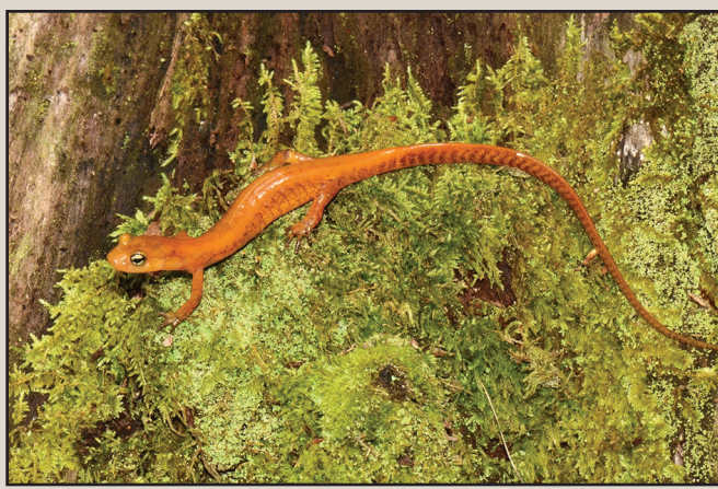
FIG. 1. Adult female Eurycea longicauda with an aberrant pattern found in Huntingdon County, Pennsylvania, USA.

al. 2008. Herpetol. Rev. 39:334). To our knowledge, this aberrant pattern we describe here has not been previously reported in E. longicauda , and appears to be rare.