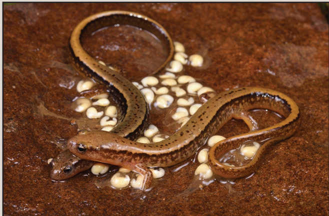
FIG. 2. Female (left) and male (right) Northern Two-lined Salamanders ( Eurycea bislineata ) with a nest.

Attendance of nests by females is commonly observed in members of the E. bislineata species complex, but published observations of males with nests are thus far limited to E. junaluska and E. aquatica (Bruce 1982. Copeia 1982:755–762; Graham et al. 2010. IRCF 17:168–172). Although the species observed here is traditionally classified as E. cirrigera , molecular phylogenetic data suggest that this name is inappropriate (see 'Lineage D' in Kozak et al. 2006. Mol. Ecol. 15:191–207; Pierson et al., unpubl. data). Instead, we refer to them conservatively as E. bislineata . To the best of our knowledge, these observations represent the first evidence of nest attendance by males in this species and suggest that the behavior might be more widespread in the E. bislineata species complex.