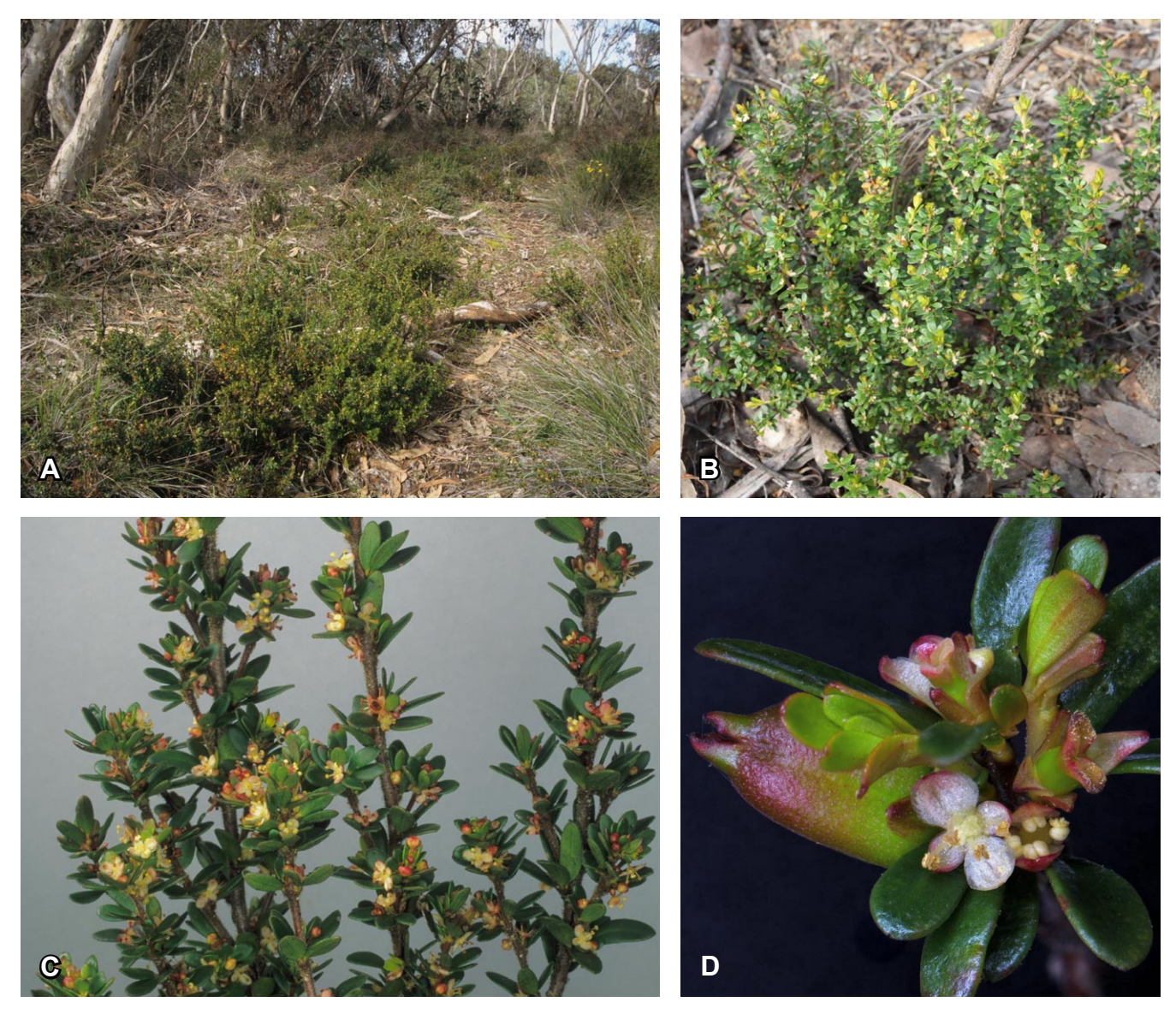
PI. 1. Micranthemum demissum . A , shrubs in pink gum woodland, Cox Scrub Conservation Park, Fleurieu Peninsula; B , shrub, SE of Myponga, Fleurieu Pen.; C , flowering branchlets with pink buds; D , shoot with developing fruit and two female flowers above two male flowers.