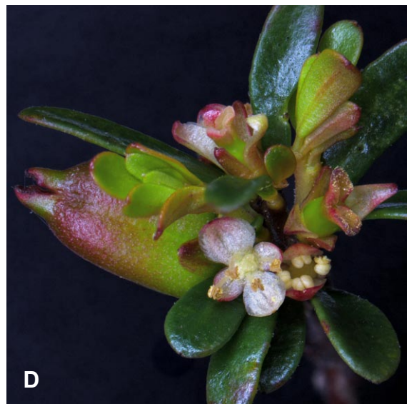
Pl. 1. Micranthemum demissum . A , shrubs in pink gum woodland, Cox Scrub Conservation Park, Fleurieu Peninsula; B , shrub, SE of Myponga, Fleurieu Pen.; C , flowering branchlets with pink buds; D , shoot with developing fruit and two female flowers above two male flowers. Photos A, B & C, P.J. Lang; D, P.J. Lang, DENR.