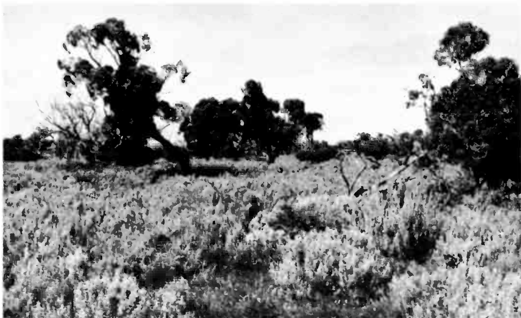
Fig. 7. Myoporum platycarpum association with Atriplex vesicaria forming a low shrub layer.