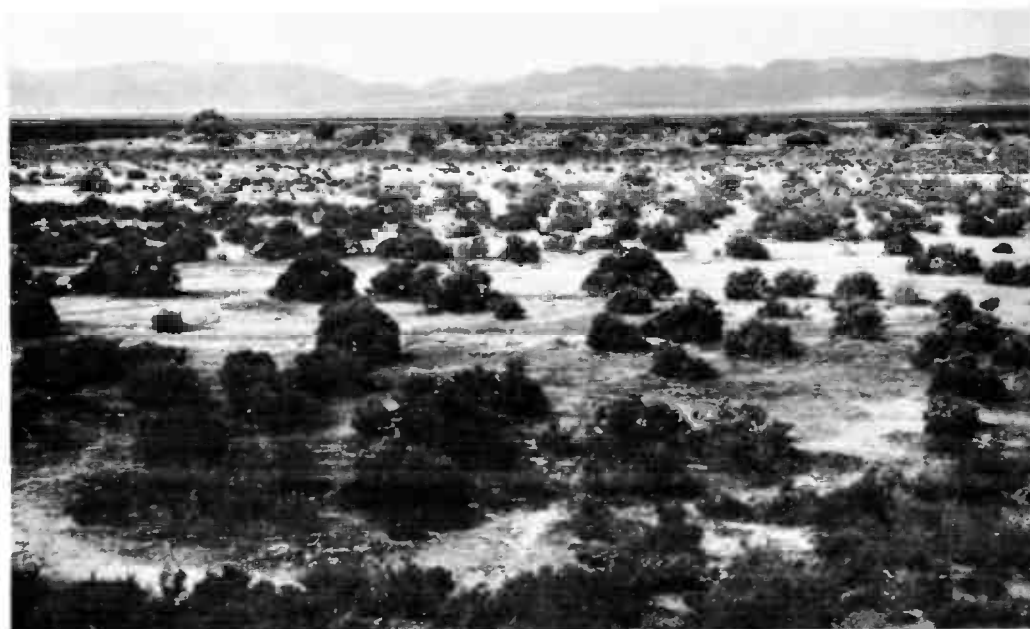
Fig. 2. Halosarcia association near Redcliff Point. Note low shell ridge "island" in background.