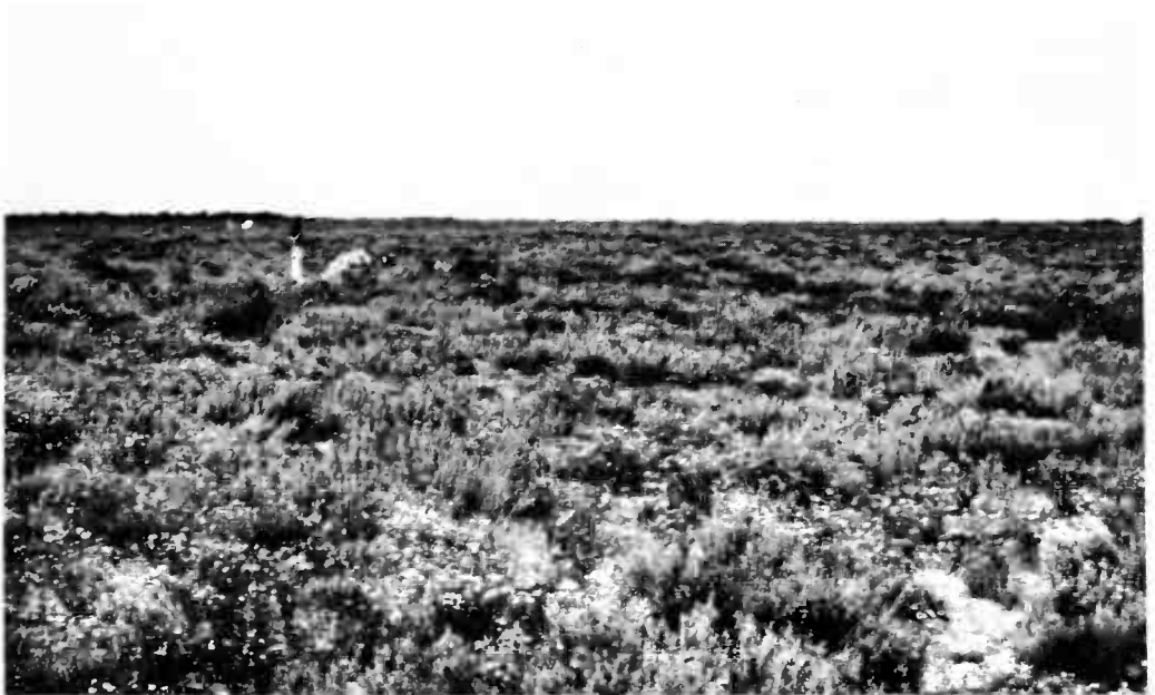
Fig. 4. Atriplex paludosa association near Redcliff Point with Senecio aff. lautus prominent in the foreground.