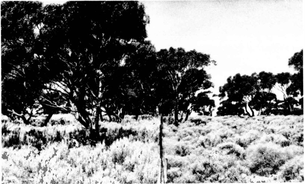
Fig. 11. Cross fence difference at Mt Gullet, Atriplex vesicaria (LHS) and Chenopodium ulicinum (RHS).