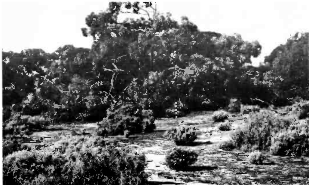
Fig. 9. Eucalyptus woodland on the northern flank of Mt Grainger. Olearia pimeleoides and Maireana pyramidata in foreground with extensive patches of lichen on sand. Scale units 10 cm.