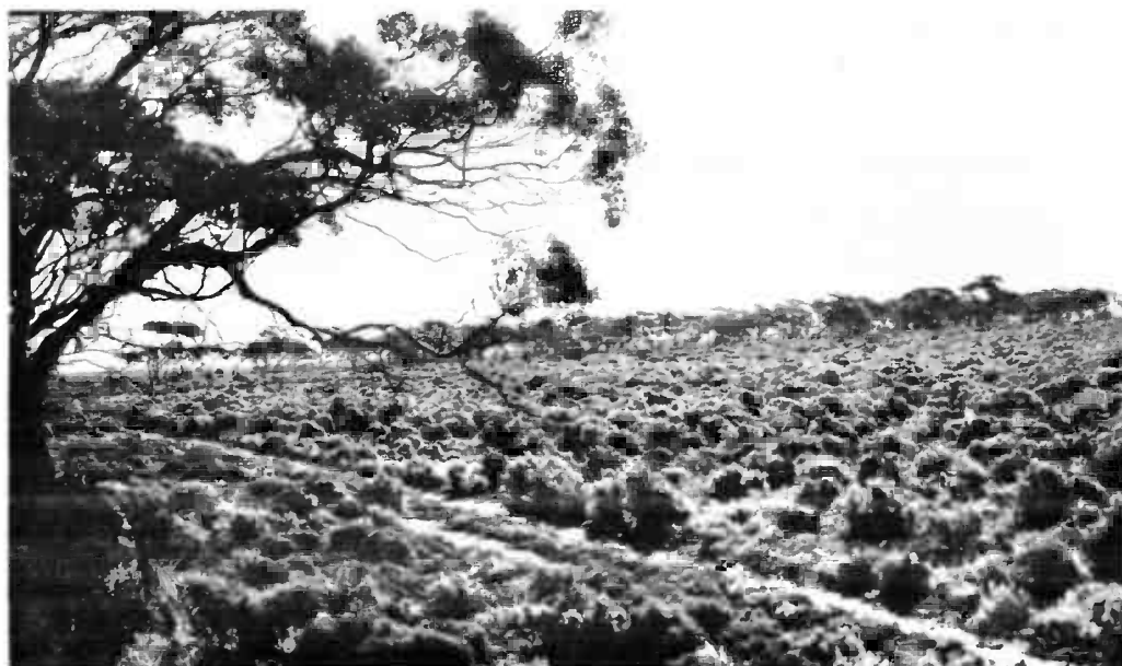
Fig. 8. Maireana pyramidata association on the eastern side of the mallee.