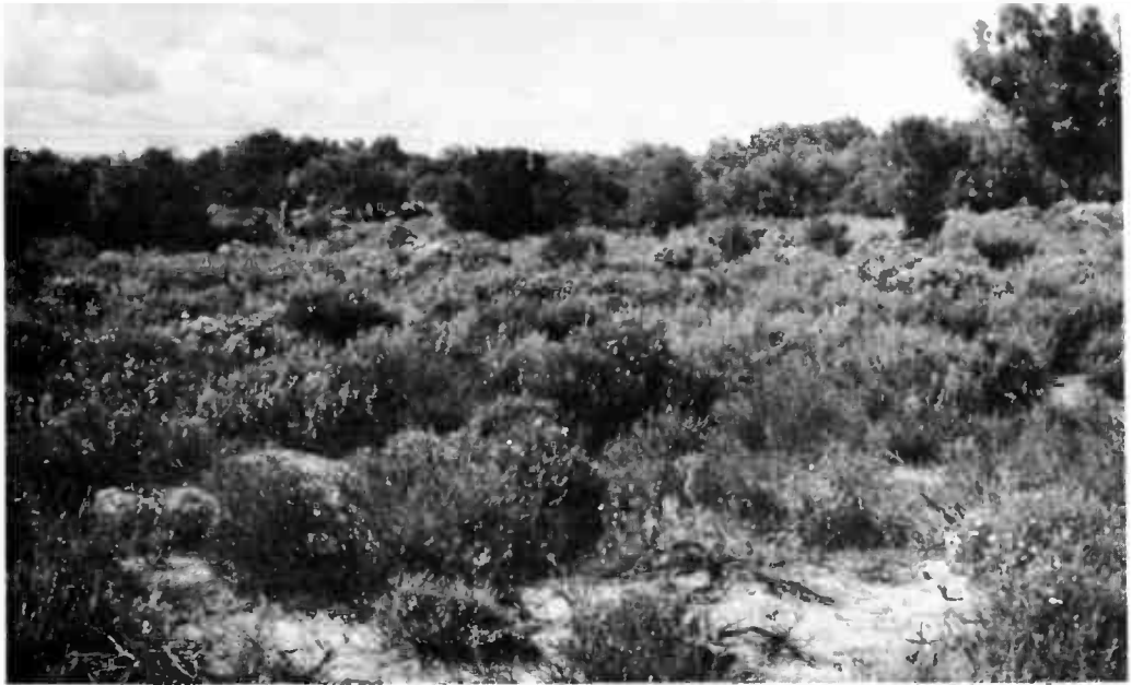
Fig. 5. Heterodendrum — Geijera — Pittosporum association with Oleāria pimeleoides in the foreground.