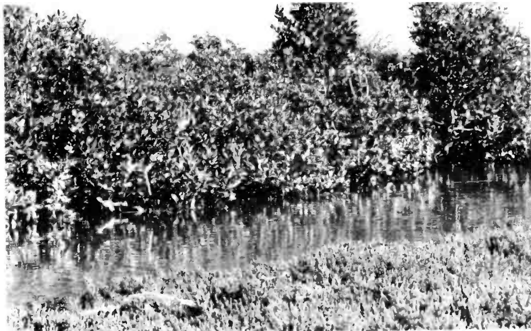
Fig. 1. Avicennia marina association, lower Chinaman Creek. Note ground layer of Sarcocornia quinqueflora in foreground.