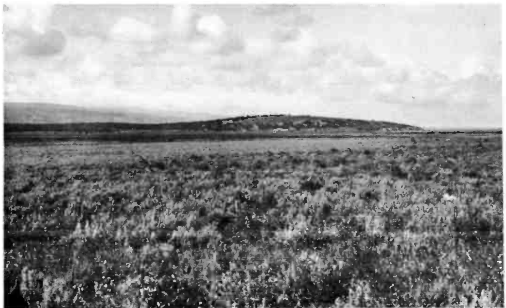
Fig. 6. Atriplex vesicaria association with Mt Grainger in the background.