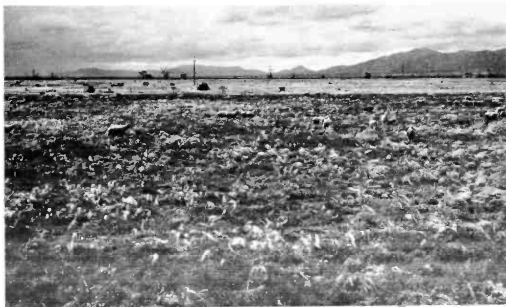
Fig. 10. Stipa grassland near highway. Note the replacement of Stipa by Carrichiera annua (Wards weed) in the foreground.