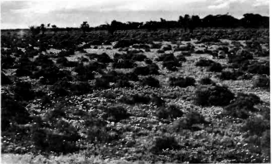
Fig. 3. Sclerostegia tenuis — Halosarcia association on the transitional mudflat—alluvial soils with rich ground layer dominated by Disphyma clavellatum . Note the scattered trees of Myoporum platycarpum and the mallee in the background.