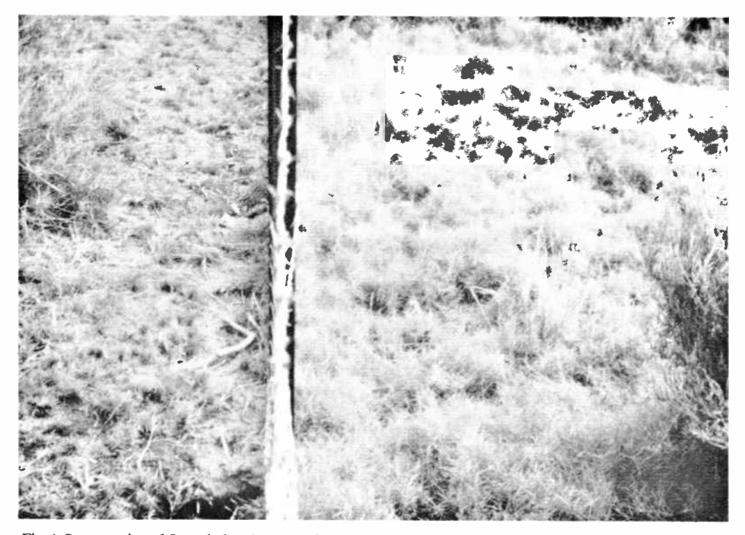
Fig. 4. Regeneration of Sporobolus virginicus after 21 months protection from rabbits and stock.

Approximately 60 km east of the Dalhousie Springs complex is Purnie Bore. This bore was put down during a period of oil exploration and has been flowing since 1964. The water forms a large lagoon several hundred metres long between the sand dunes. Regrettably since then this portion of the desert has been stocked with cattle.