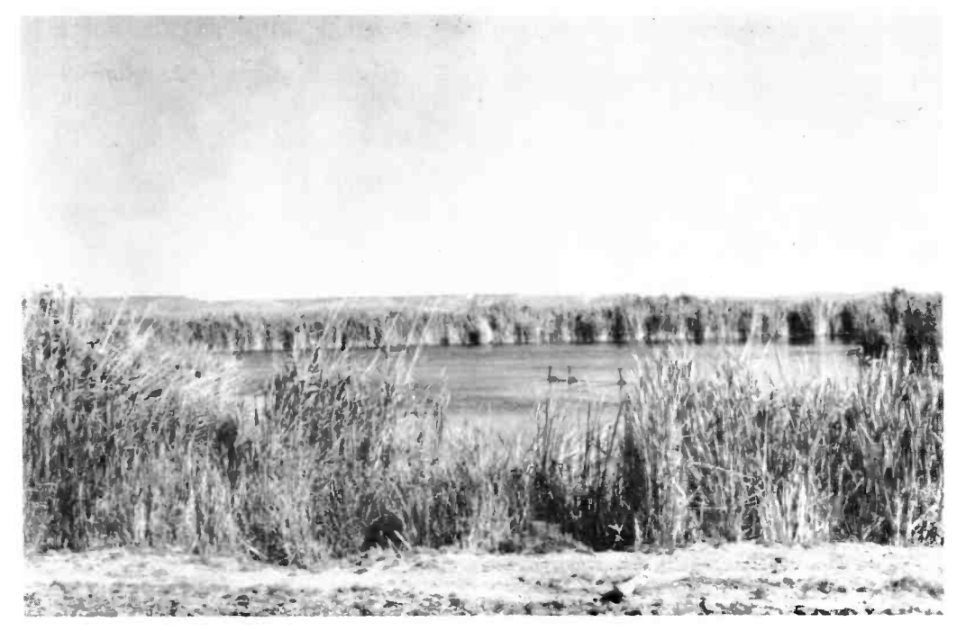
Fig. 1. Typha and Phragmites surrounding one of the largest free-water springs.