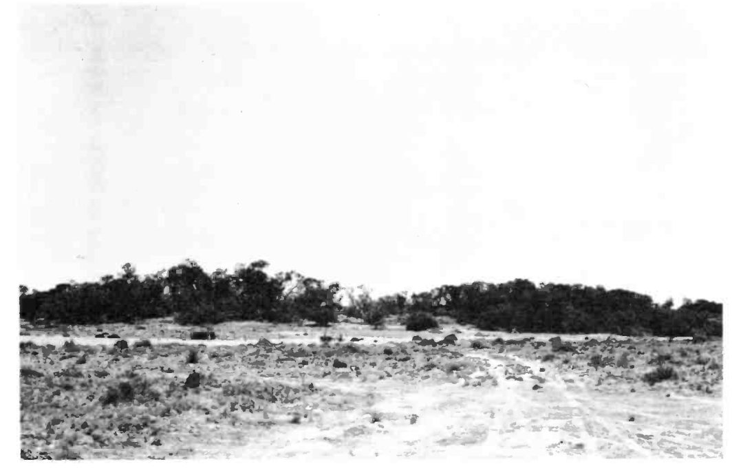
Fig. 2. General view of low mound showing the dense vegetation surrounding the large spring (out of sight). The farm implements were abandoned after efforts to use the spring for irrigation. Assorted halophytes in the foreground.