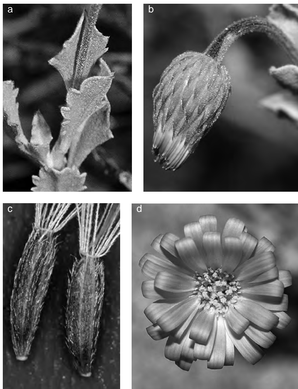
Fig. 1. Olearia arckaringensis . a leaves on upper stem; b bud showing involucre bracts; c cypselas; d flower head. a, b, d from photos by A.C. Robinson (ACR BSOP-270).

thickened, stramineous. Receptacle flat. Ray florets 36–60, irregularly 3-seriate, female, 11–18 mm long, with sparse, biseriate, patent, botuliform, minute, eglandular hairs scattered externally on the lower limb and upper tube; ligules lavender, or occasionally white, often recurved to lightly revolute in flower, 7\text{--}15 \times 1.3\text{--}2.8 mm, obtuse and minutely (2–) 3-lobed apically; stylar arms ligulate, 1–1.2 mm long, densely and minutely papillate. Disc florets 44–72, bisexual, 6.7–9.4 mm long; corolla tube 4.2–5.8 mm long, yellow, glabrous; corolla lobes 5, 0.4–1.3 mm long, triangular, with sparse, biseriate, patent, botuliform, minute, eglandular hairs outside; anthers c. 2 \times 0.25 mm with narrow-triangular sterile terminal appendages; stylar arms ligulate, c.