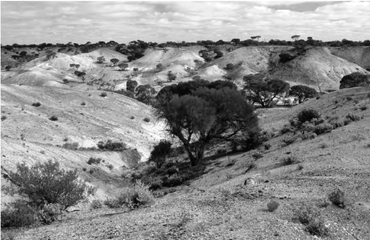
Fig. 2. Habitat on soft eroded gravelly slopes of erosion gully; the small paler shrubs are Olearia arckaringensis which extends from the foreground to just beyond the Western Myall ( Acacia papyrocarpa ) in the centre.