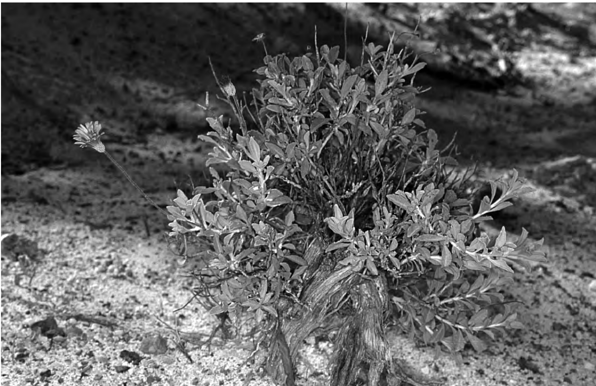
Fig. 3. Habit of Olearia arckaringensis : an old gnarled shrub with thick woody base (P.J. Lang BSOP-431).