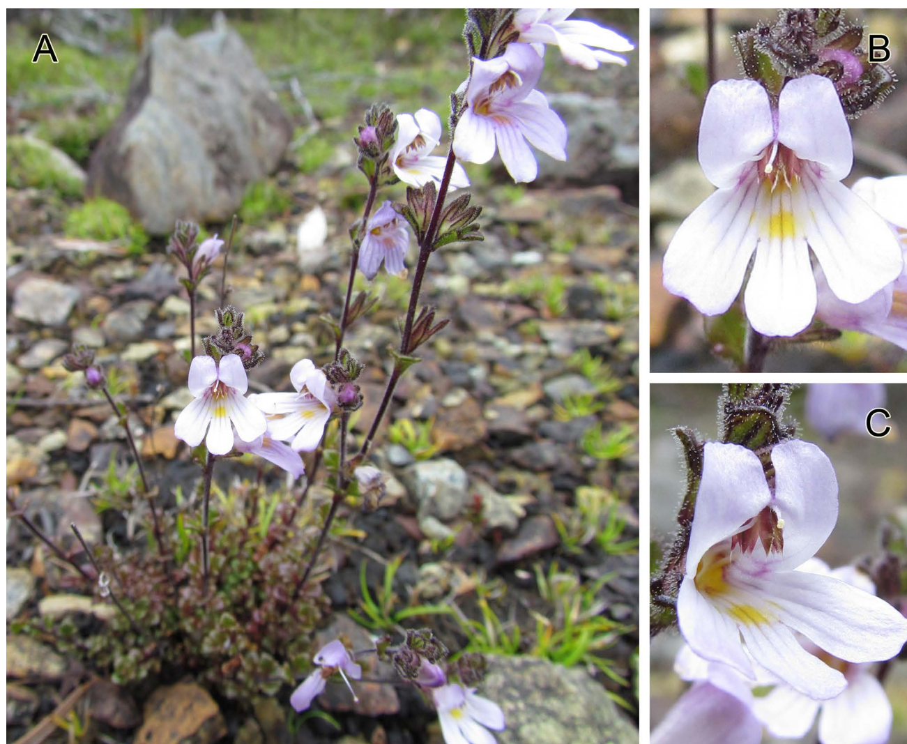
Fig. 1. Euphrasia amplidens . A growth habit; B flower (from front); C flower (part side on).

purple lines on front of lobes, darker behind, becoming darker after anthesis, with mid yellow spot on lower side of mouth and deep in throat at point of insertion of stamens; tube c. 5.0–5.5 mm long, externally glabrous, but for distal extension of hood indumentum and short glandular hairs at separation of lips; hood c. 4.0 mm long, including lobes c. 5–5.5 mm broad, excluding lobes c. 2.5–3 mm broad, externally covered with dense, moderately long (0.2 mm), antrorse eglandular hairs, internally with long fine eglandular hairs at distal end behind upper cleft, otherwise apparently glabrous, the upper lobes facing forward in more or less same plane, erose-truncate or shallowly emarginate, glabrous behind, with cleft between c. 1.7 mm deep; lower lip concave from above, downturned, c. 8 × 9–10 mm, glabrous externally proximal parts covered by sparse to dense short eglandular hairs mixed with scattered short glandular hairs, distally glabrous, the lower lobes shallowly emarginate, with clefts between c. 4 mm deep. Stamens with filaments glabrous, the anterior pair c. 4–4.5 mm long, the posterior c. 3.5–4 mm long; anthers