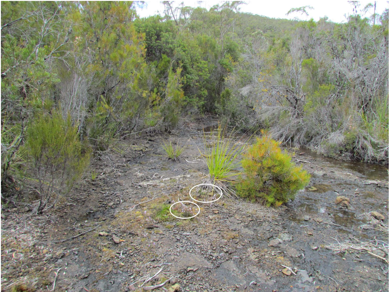
Fig. 5. Euphrasia amplidens grows in and around the “islands” of vegetation and on the fringes of the scrub around the open sediment pans (individuals circled).

flora recovery plan (Threatened Species Section 2011), which includes relevant information on the management of locally restricted taxa.