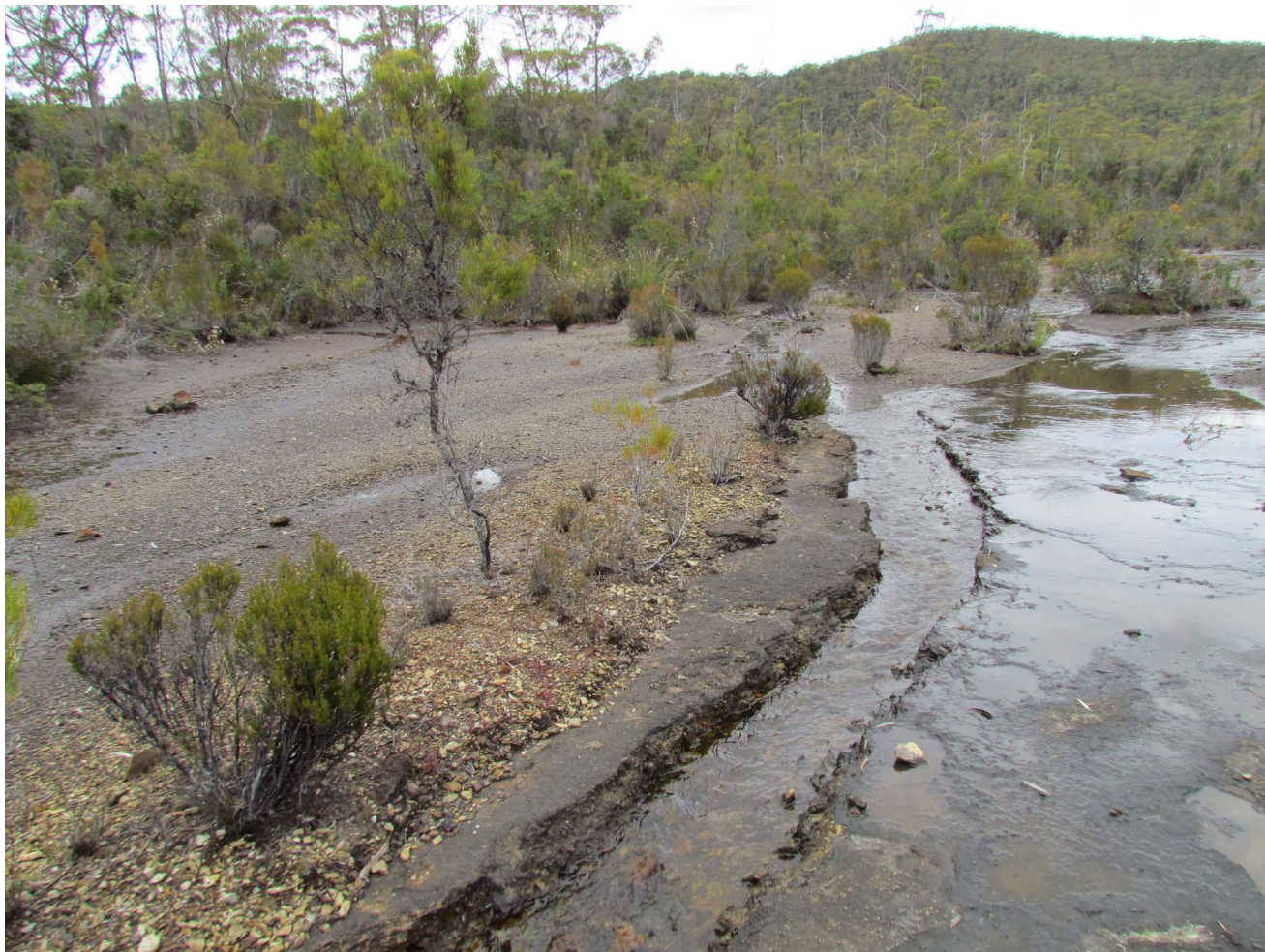
Fig. 4. Typical habitat of Euphrasia amplidens – an open sediment pan amongst otherwise dense scrubby eucalypt woodland.

applied to an area of land with high mineral potential or prospectivity and predominantly in a natural state. The purpose of such reserves is mineral exploration and development of mineral deposits, and the controlled use of other natural resources, while protecting and maintaining the natural and cultural values of that area of land.