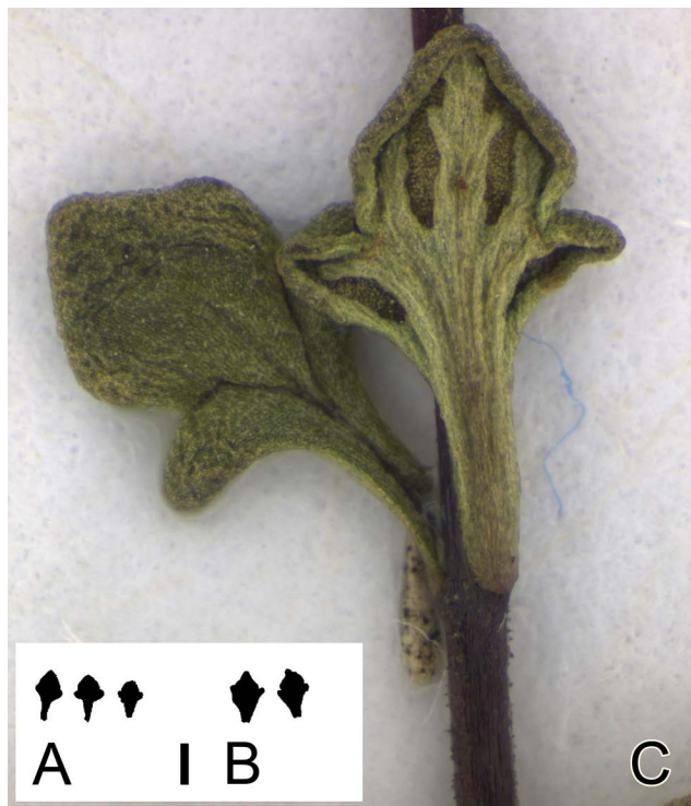
Fig. 2. Uppermost leaves, from dried herbarium specimens, of main inflorescence-bearing axes in Euphrasia amplidens . A–B Upper inflorescence leaves, silhouettes in actual size; C Upper pair of leaves, just below inflorescence, of showing adaxial (LHS) and abaxial (RHS) leaf surfaces. Scale bar: 0.5 mm. — A M. Wapstra & B. French s.n. (AD250975); B P. Milner 16 (AD250981); C K. Ziegler s.n. (HO566956, right hand sprig on sheet).

evident in E. striata R.Br., E. fragosa W.R.Barker and E. semipicta W.R.Barker, but from all of these it differs by its glandular indumentum, dense on the calyces, bracts and rachis and extending onto the leaves and branches.