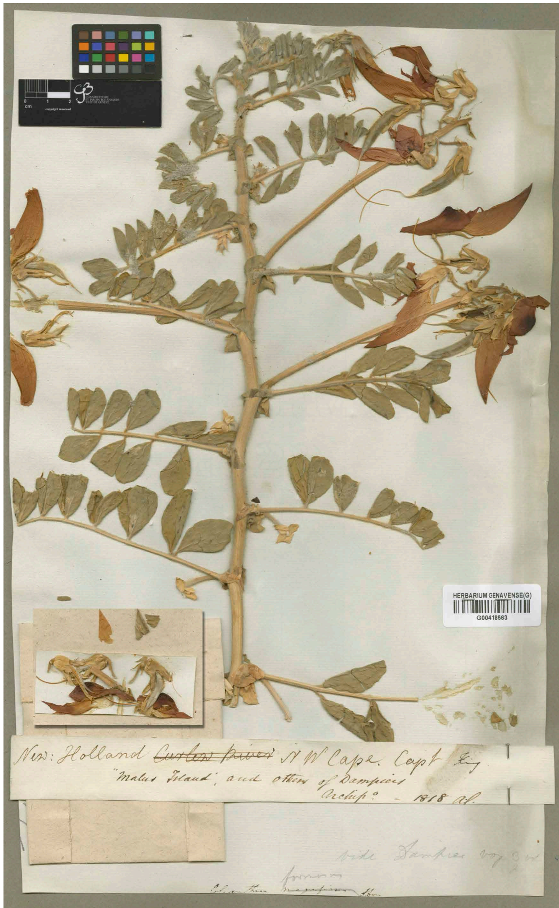
Fig. 1. The holotype of Donia formosa G. Don, sheet G 00418563 in the Phanerogamic Herbarium, Conservatoire et jardin botaniques, Geneva, Switzerland (reproduced by permission).