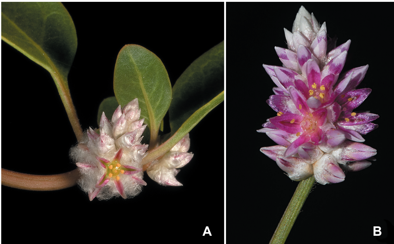
Fig. 1. Comparative morphology of flowering inflorescences. A Ptilotus murrayi ; B P. gomphrenoides .

Australia, on the basis of its larger leaves, longer stems and inflorescences, and slightly longer sepals. This variety was synonymised by Bean (2008), who recognized that the characters attributed to P. murrayi var. major were within the typical variability of var. murrayi . In a manuscript by Benl (unpubl.), P. petiolatus subsp. limbatus Benl MS was included as a manuscript name based on a specimen from Edaggee Station, Western Australia (Fig. 2), which he primarily differentiated from subsp. petiolatus by the new subspecies having clawed sepals. While the new taxon was never formalised, it was included under the phrase name Ptilotus sp. Edaggee Station (T.E.H.Aplin 3208) at the Western Australian Herbarium awaiting evaluation of its taxonomic status.