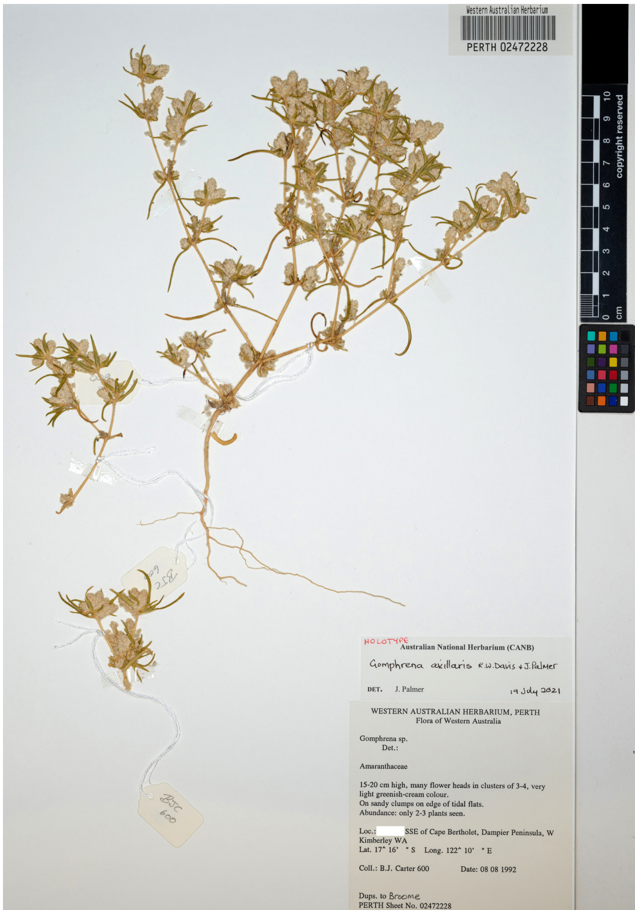
Fig 2. Holotype of Gomephrena axillaris , B.J. Carter 600 (PERTH02472228).