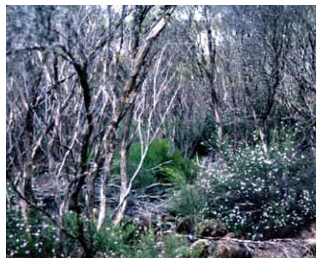
Monarto mintbush growing in broombush scrub.