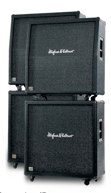
VC 412 A30/B30 If you favor the assertive thump of Vintage 30 speakers, these cabs will help you hammer out the riffs. Available in straight (B) and slanted (A).

60 watts • 480 x 450 x 285 mm • 13.5 kg/30 lbs