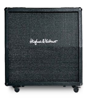
SC 412 Designed to stand up to the rigors of touring life and packing a knockout punch, the SC 412 sports advanced Hughes & Kettner® RockDriver Ultra II guitar speakers in a road-ready plywood enclosure.

8 \Omega mono, 2 x 4 \Omega stereo • 400 w • 750 x 750 x 360 mm • 31 kg/68 lbs