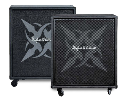
MC 412 CL Equipped with Celestion Classic Lead speakers, this oversized cab transforms Coreblade's primal power into massive sound pressure. 8 Ω mono, 2 x 4 Ω stereo • 320 w mono, 160 w stereo • 762 x 362 x 830 mm • 52 kg/114.6 lbs

8 \Omega mono, 2 x 4 \Omega stereo • 400 w • 750 x 750 x 360 mm • 31 kg/68 lbs