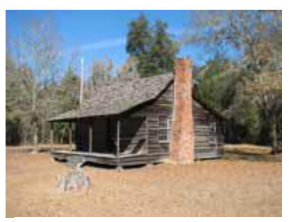
Early House at Jones Creek Community Park

Currently the County only has one recreational park, located in City of Ludowici. The State owns the Griffin Ridge Wildlife Management Area southwest of the City of Ludowici along the Altamaha River, and has acquired additional lands along the Altamaha River in the southeast corner of the County.