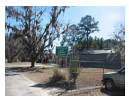
Road Maintenance Facility