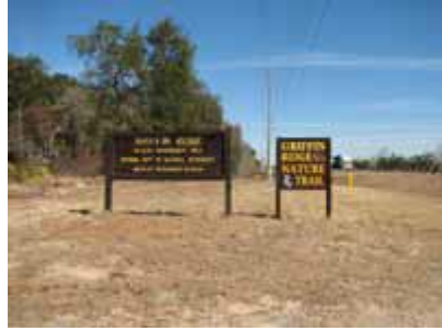
Griffin Ridge Wildlife Management Area