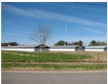
Long County Agriculture

Long County and the City of Ludowici is interested in maintaining its rural character. The County and City should consider this priority when making future land use decisions.